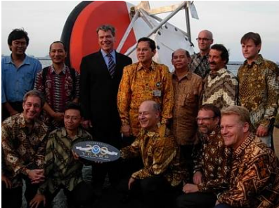
Indonesian and U.S. officials with the DART tsunameter

The second Deep-ocean Assessment and Reporting of Tsunamis (DART) buoy in the Indian Ocean was launched on September 19, 2007, under the USAID-funded US IOTWS. The tsunameter station includes a pressure gauge set on the ocean floor to monitor sea-level changes and communications equipment to send data via satellite to global networks. This is the first DART tsunameter managed by the Indonesian government, through the Agency for Assessment and Application of Technology (BPPT). Following a launching ceremony in Jakarta, which also marked the deployment of four ATLAS buoys to monitor climate change, the DART buoy was placed off the coast of West Sumatra at approximately 0°N and 92°E. The U.S. National Oceanic and Atmospheric Administration, BPPT, and Indonesia's Agency for Marine and Fisheries Research also agreed to future exchanges for capacity building in tsunami detection, climate monitoring, and fisheries management. Several earthquakes in Sumatra over the previous week, including a massive one measuring 8.2 on the Richter scale, underscores the need for a fully operational tsunami warning system and effective communication between warning centers and coastal communities. This tsunameter joins one jointly deployed with Thailand under the US IOTWS Program in December 2006 in a planned array of buoys that will ring the Indian Ocean to provide real-time data on potential tsunamis.