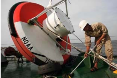
A technician checks the DART buoy before its launch into the Indian Ocean