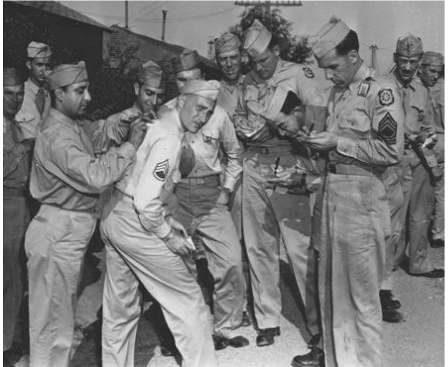
Soldiers receiving three-day passes from Camp Ross, Los Angeles Port, during World War II. This image and others will soon be available on NARA's ARC.