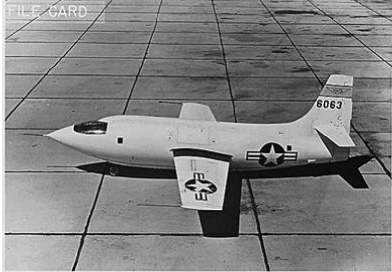
The XS-1, the first plane to break the sound barrier, ca. 1947. From ARC, number 295650.

photographs showing the Los Angeles Port during World War II. These digital copies of photographs will join about 1,800 other documents from the Pacific Region already available on ARC. We will also be adding past monthly reports from the US Geological Survey's Branch of Astrogeology in Flagstaff, Arizona, that document that office's significant contributions to the Apollo programs through lunar mapping,