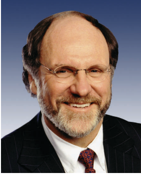
Sen. Jon S. Corzine of Hoboken Democrat—Jan. 3, 2001