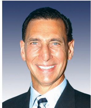
Frank A. LoBiondo of Ventnor (2d District) Republican—6th term