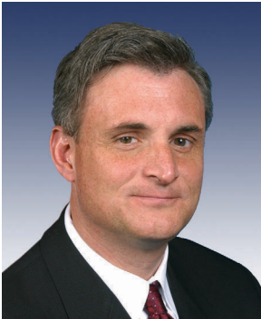
Robert E. Andrews of Haddon Heights (1st District) Democrat—9th term