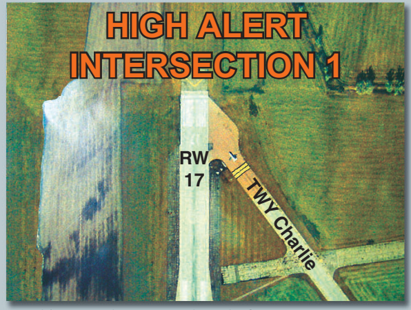
Looking North. Approach end of Runway 17.