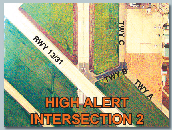
Looking North. Complex Runway Intersection of Runway 17/35 and 13/31 at Taxiway Bravo.