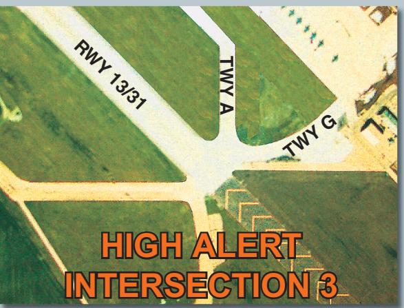
Looking North. Approach end of Runway 31 at intersection of Taxiway A and G.

Airport Operations: (712) 279-6167 Air Traffic Control: (712) 277-3424