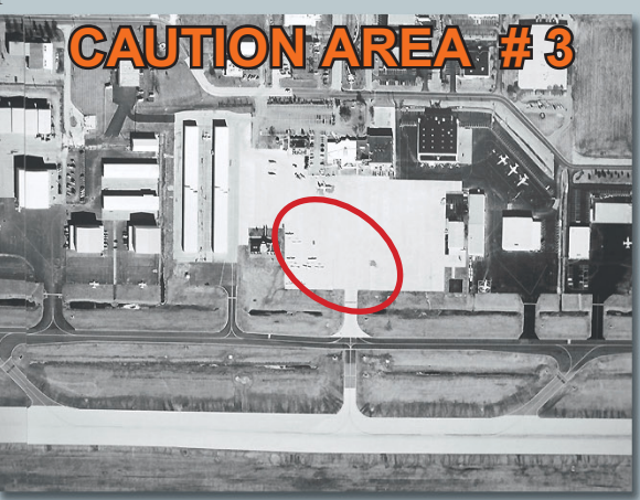
Looking North. Taxiway Alpha-5 and non-movement area boundary.

Airport Operations: (636) 532-2222 Air Traffic Control: (314) 890-7282 Hours of Operation: Airport: 24 hours