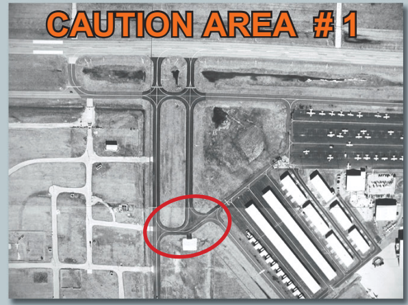
Looking North. Complex intersection of Taxiway B, C. D and Z