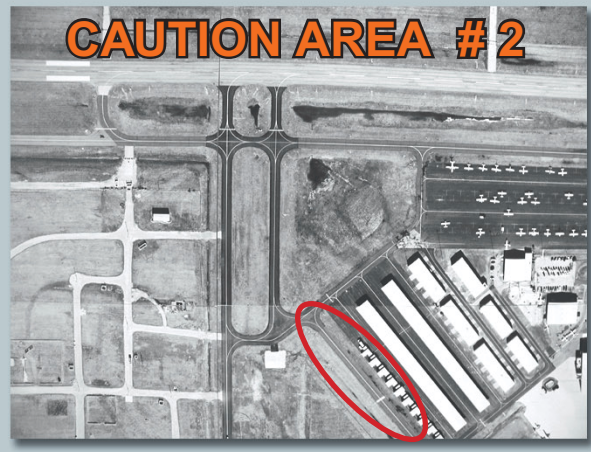
Looking North. Taxiway Bravo west of blue port-aports.