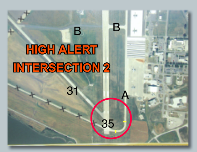
Looking North. Approach end of Runway 31 and Runway 35 at intersection of Taxiway A. Note that the hold marking for Runway 31 is north of the hold marking for Runway 35 on Taxiway Alpha.

Airport Authority: (816) 271-4886 Air Traffic Control: (816) 236-3682