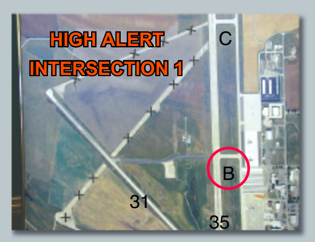
Looking North. Intersection of Runway 35 and Taxiway B.