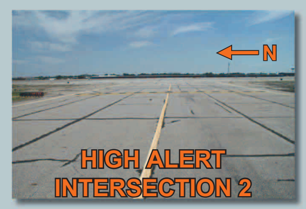
Looking East. Taxiway B intersection with Runway 17-35