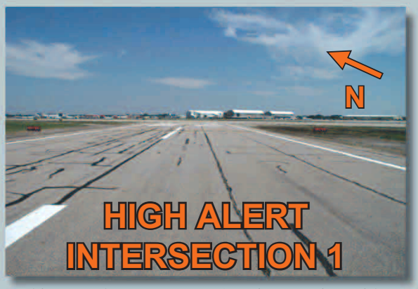
Looking Northeast. Runway 4-22 intersection with Runway 17-35