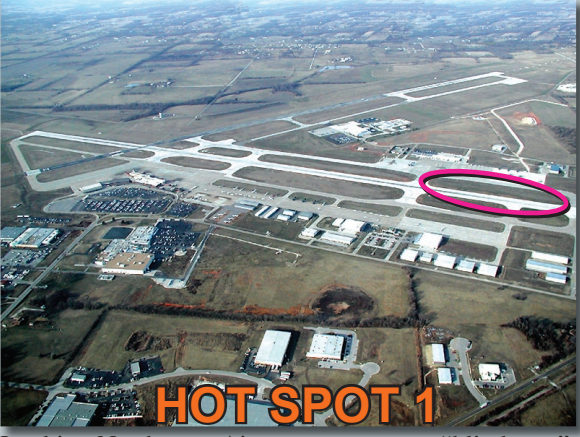
Looking Northwest. Air cargo ramp area "blind spot" from tower.