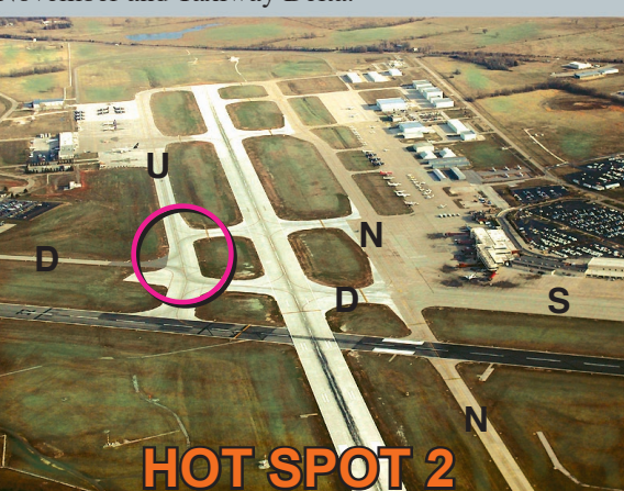
Looking Northeast. Intersection of Taxiway Delta and Taxiway Uniform. Notice the "jog" Taxiway Delta makes as it crosses Taxiway Uniform.

Airport Operations: (417) 869-1990 Air Traffic Control: (417) 868-5600 Hours of Operation: Airport: 24 hours,