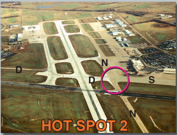
Looking Northeast. Intersection of Taxiway November and Taxiway Delta.