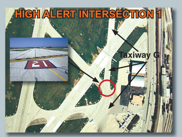
Looking North. Intersection of Taxiway G and Runway 21.