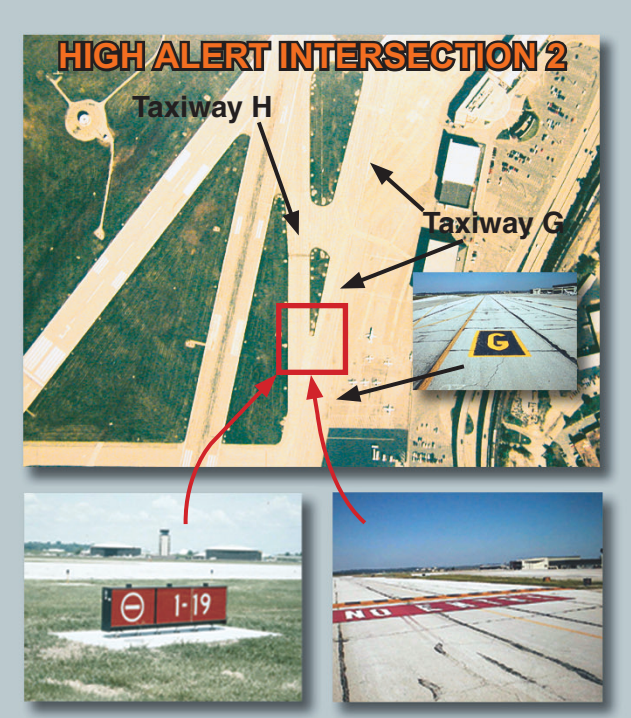
Looking North. Intersection of Taxiway G and Taxiway H.

Air Traffic Control: (816) 471-4946 Air Traffic Control: (816) 243-2880 Hours of Operation: Airport: 24 hours