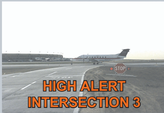
Looking South. Intersection of taxiway G and Ottawa Avenue.

Airport Operations: (816) 243-5248 Air Traffic Control: (816) 243-2700 Hours of Operation: 24 hours Latitude: N39°-17-86 Longitude: W94°-42-84 Elevation: 1026 ft. Variation: 04°E From City: 17 miles NNW Sectional chart: Kansas City Control Tower: Yes ARTCC: Kansas City Center FSS: Columbia Flight Service Station (1-800 992-7433) NOTAMs Facility: FAA Columbia Wind Indicator: Yes Beacon: Yes Fire and Rescue: On Site Airline Operations: Yes Customs: Yes UNICOM: 122.95 ATIS: 128.35 MCI Ground: 121.8 MCI Tower: 128.2 Clearance Delivery: 135.7 Approach Control: 124.7 Emergency: 121.5