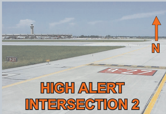
Intersection at taxiway F and Rwy 9/27.