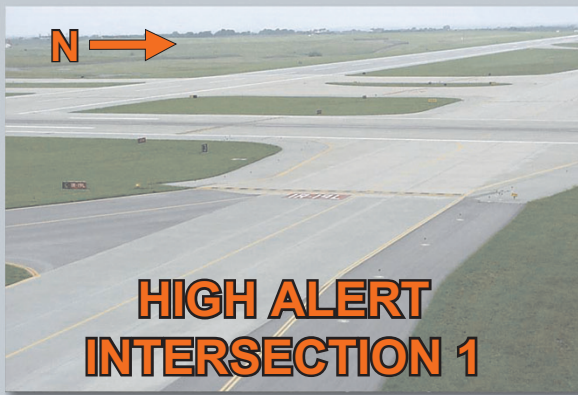
Intersection at taxiway C and Rwy 1R/19L.