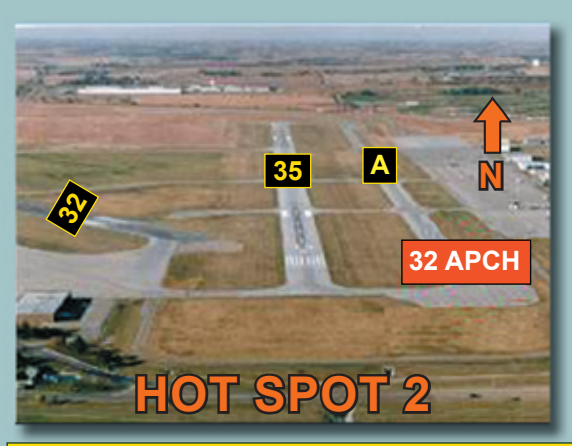
Runway 32 Approach Hold Line is Located ON Taxiway A.