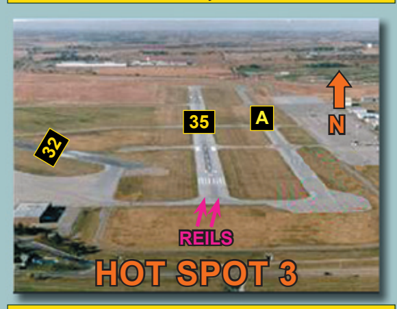
Runway 17/35 and Taxiway A

Air Traffic Control: (402) 458-2423 Air Traffic Control: (402) 474-3011 Hours of Operation: Airport 24 hours