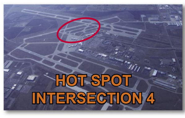
Location of "Charlie" and "Kilo" taxiway complex.