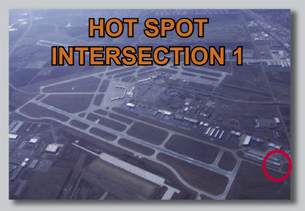
Location of Taxiway Hotel and "T" Hangars.