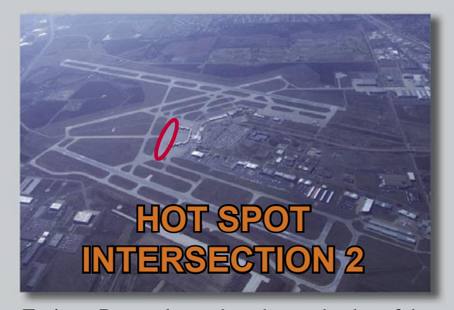
Taxiway Romeo located on the south edge of the terminal ramp.