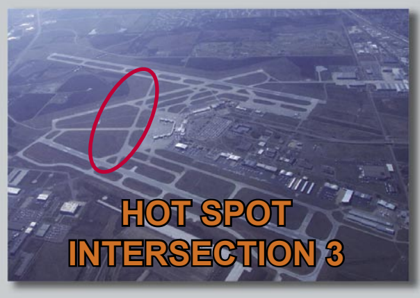
Taxiway Bravo complex serving all runways.

Airport Operations: (316) 946-4700 Air Traffic Control: (316) 941-0800