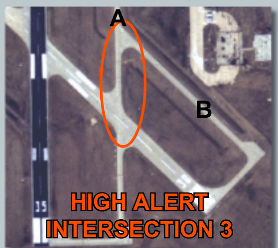
Looking North. Intersection of Taxiway A, Taxiway B and Runway 30.

Airport Operations: (620) 276-1190 Air Traffic Control: (620) 276-8994