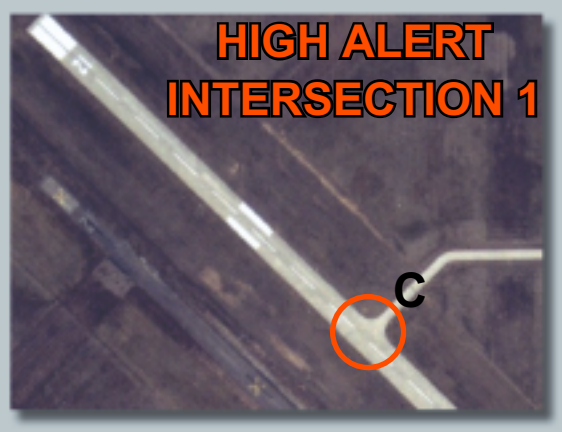
Looking North. Intersection of Taxiway C and Runway 12.