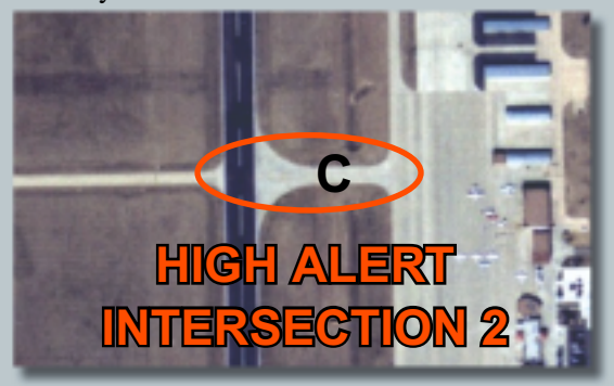
Looking North. Intersection of Taxiway Charlie, Runway 17/35 and Parking Ramp.