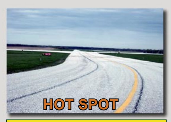
Looking Southwest on Taxiway B approaching hold short sign and marking