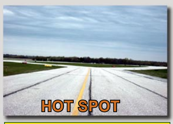
Looking West at the Y intersection on Taxiway B and D.