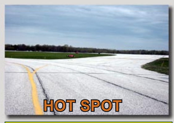
Looking Northwest on Taixway D approaching the hold short sign and marking.