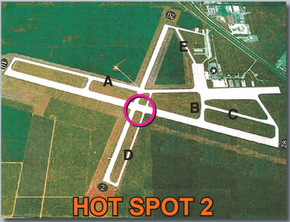
Looking North. Intersection of Runways 10/28, 2/20 and Taxiway D.

Airport Operations: (573) 334-6230 Air Traffic Control: (573) 334-3843