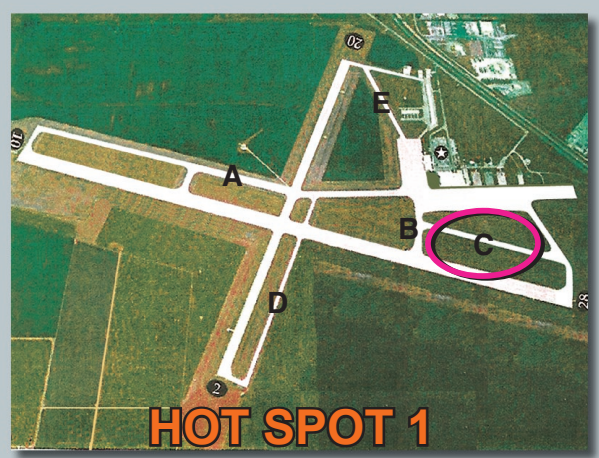
Looking North. Taxiway Charlie between Taxiway Bravo and the approach end of Runway 28.