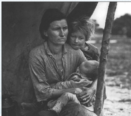
"Migrant Mother" Dorothea Lange, Feb. 1936