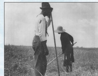
Cotton Sharecroppers. Greene County, Georgia. They produce little, sell little, buy little. Dorothea Lange, June 1937.

The photographs are drawn from the massive Farm Security Administration photography collection at the Library of Congress. Their work includes some of the most familiar and powerful images of the nation to emerge from those difficult years. Many have reached iconic status in American culture.