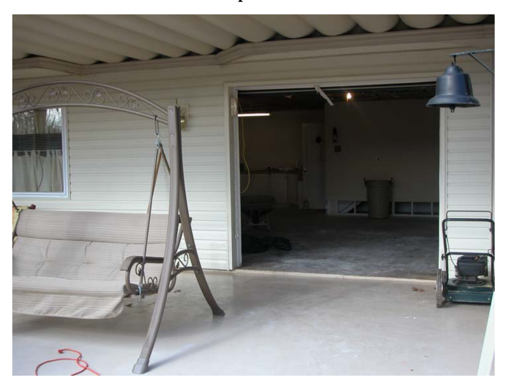
Figure 2. View of the drywall removal from the bottom 12 inches of the walls.