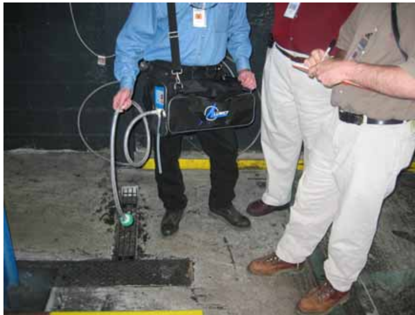
FIGURE 3 - EPA staff using the Lumex to analyze real-time air samples from the SVES exhaust pipe air-sampling valve. Duracell, Cleveland, Bradley County, Tennessee