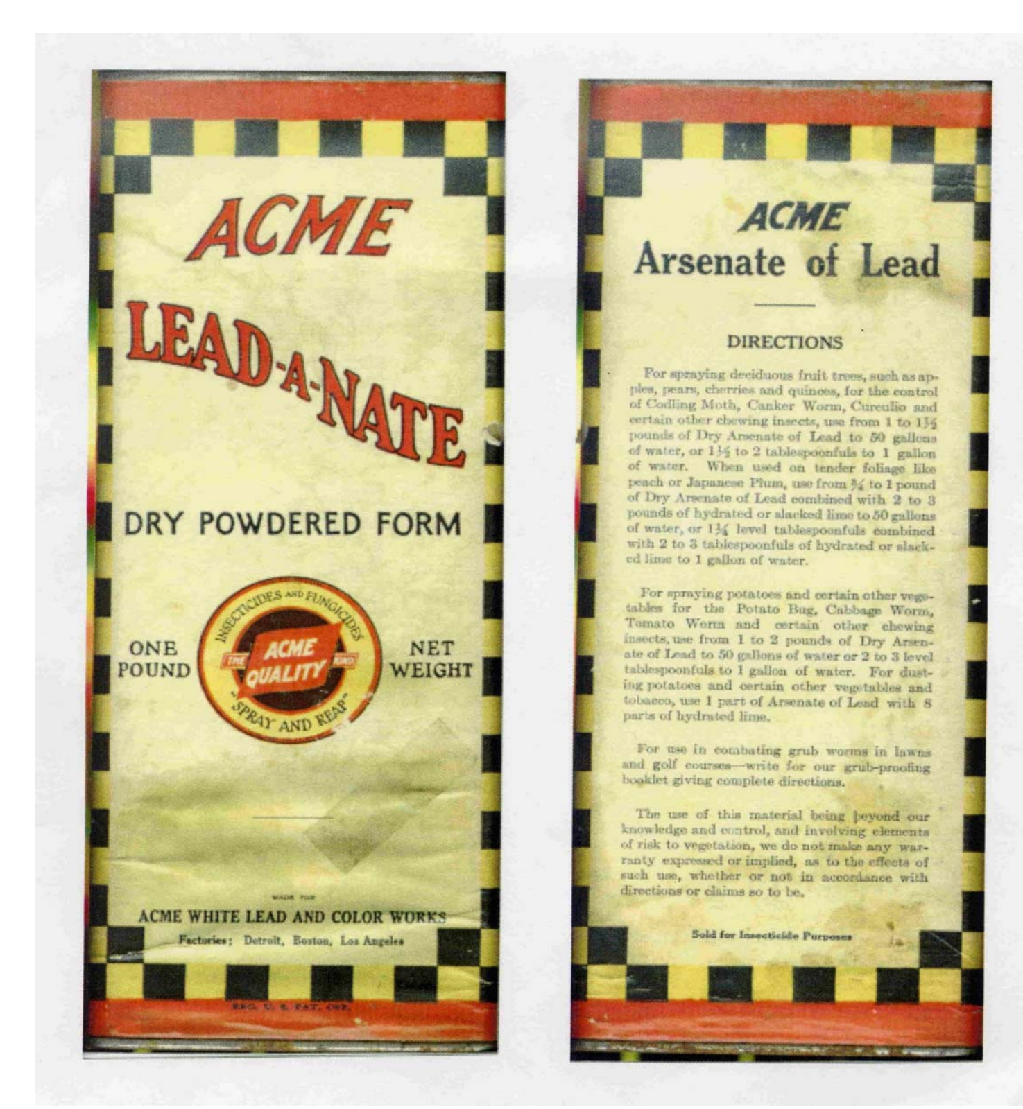
Figure 3. Directions for spraying lead arsenate in deciduous fruit trees, Eastern Washington.