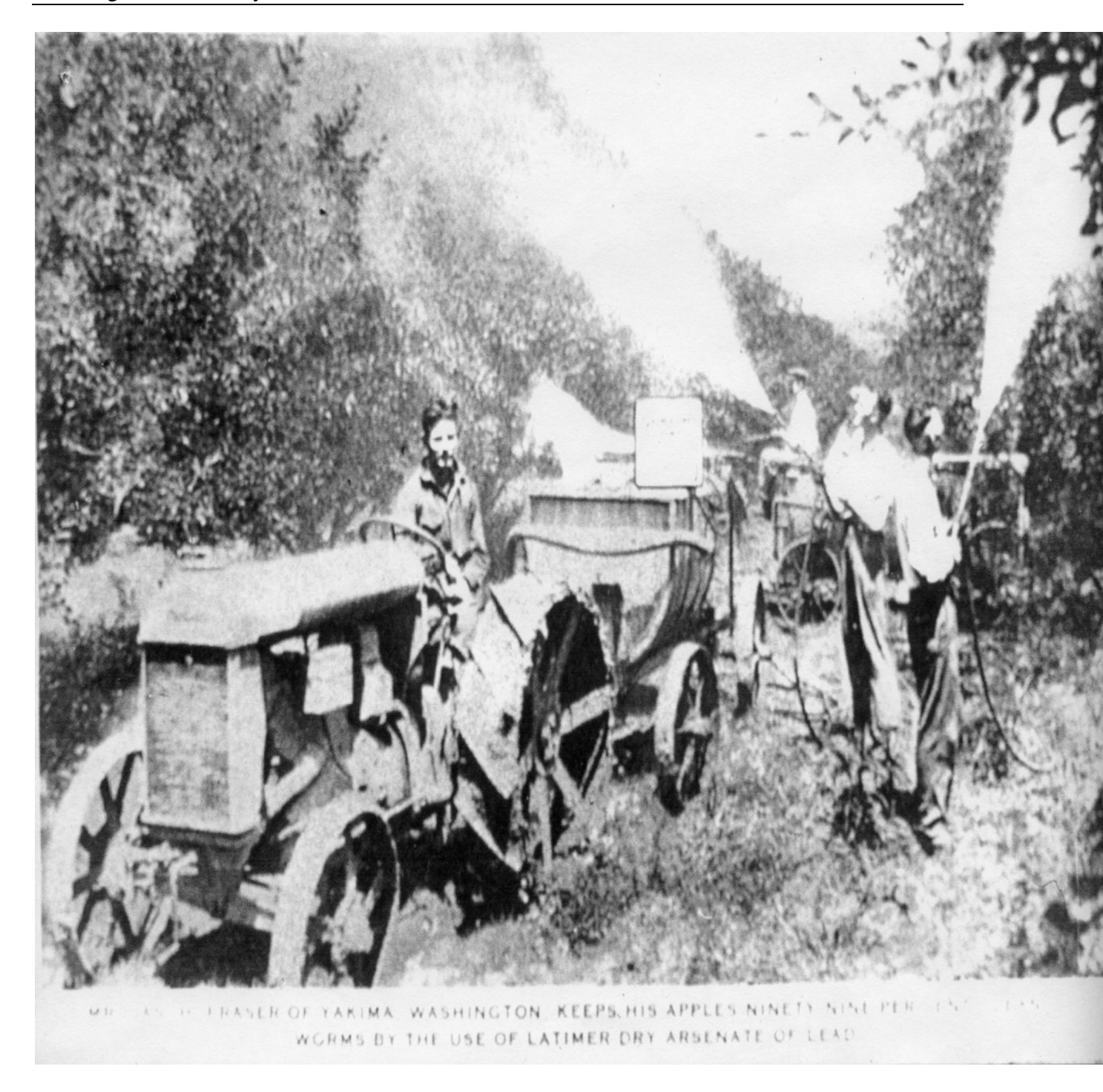
Figure 2. Farmers spraying Lead Arsenate in pears and apples in Eastern Washington.