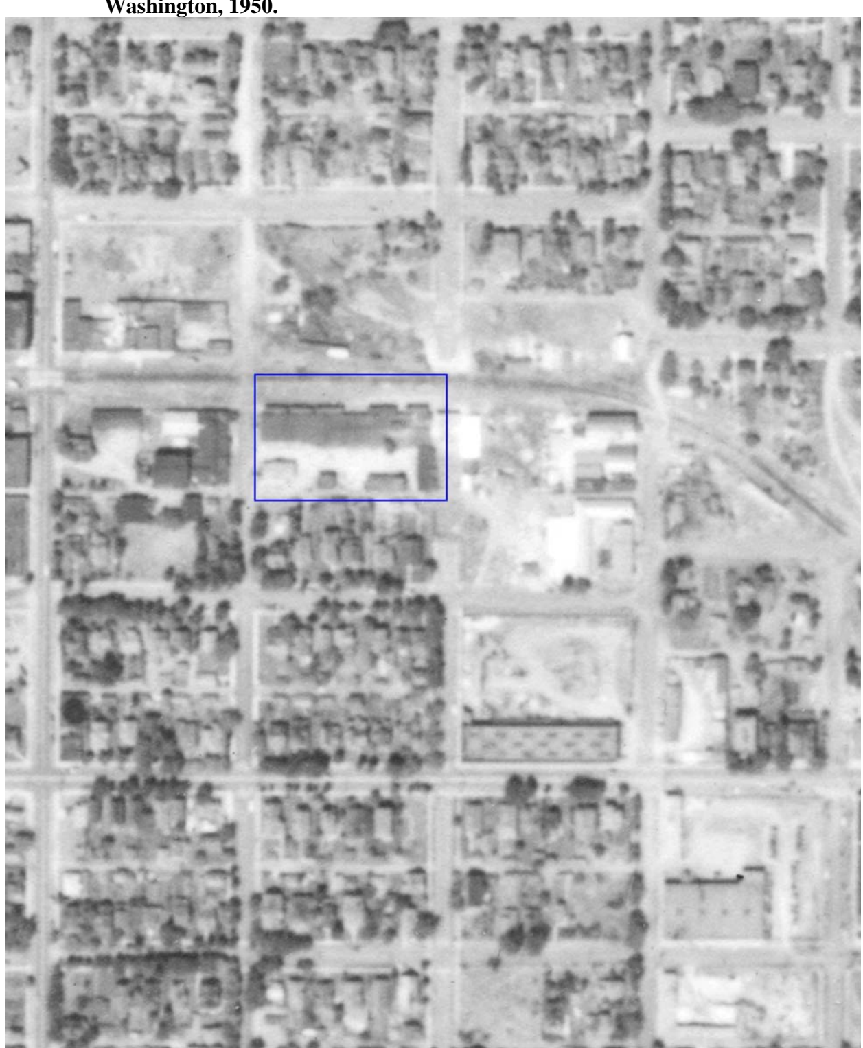
Figure 2 - Aerial Photograph of Vermiculite NW (outlined in blue) and Vicinity. Spokane, Washington, 1950.