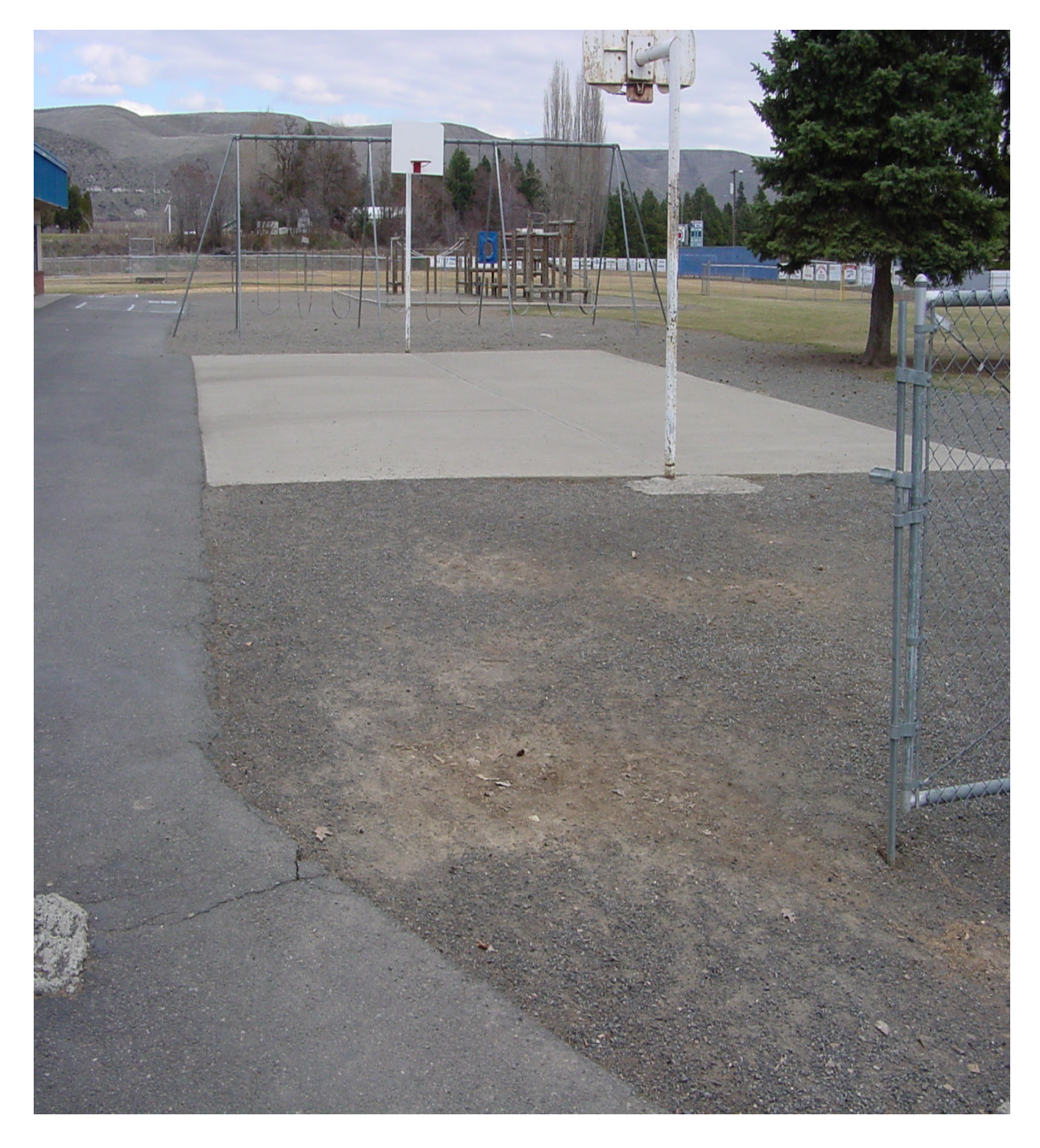
Figure 4. Naches Valley Intermediate School playfields, Naches, Washington.