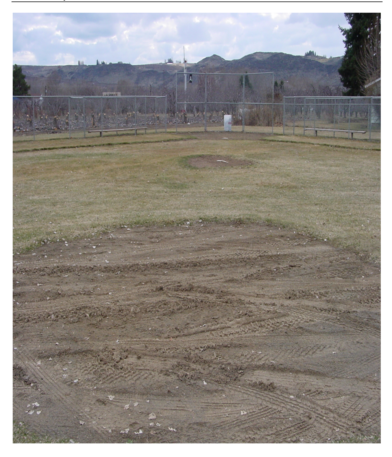
Figure 3. Softball field at Naches Valley Intermediate School, Naches, Washington.