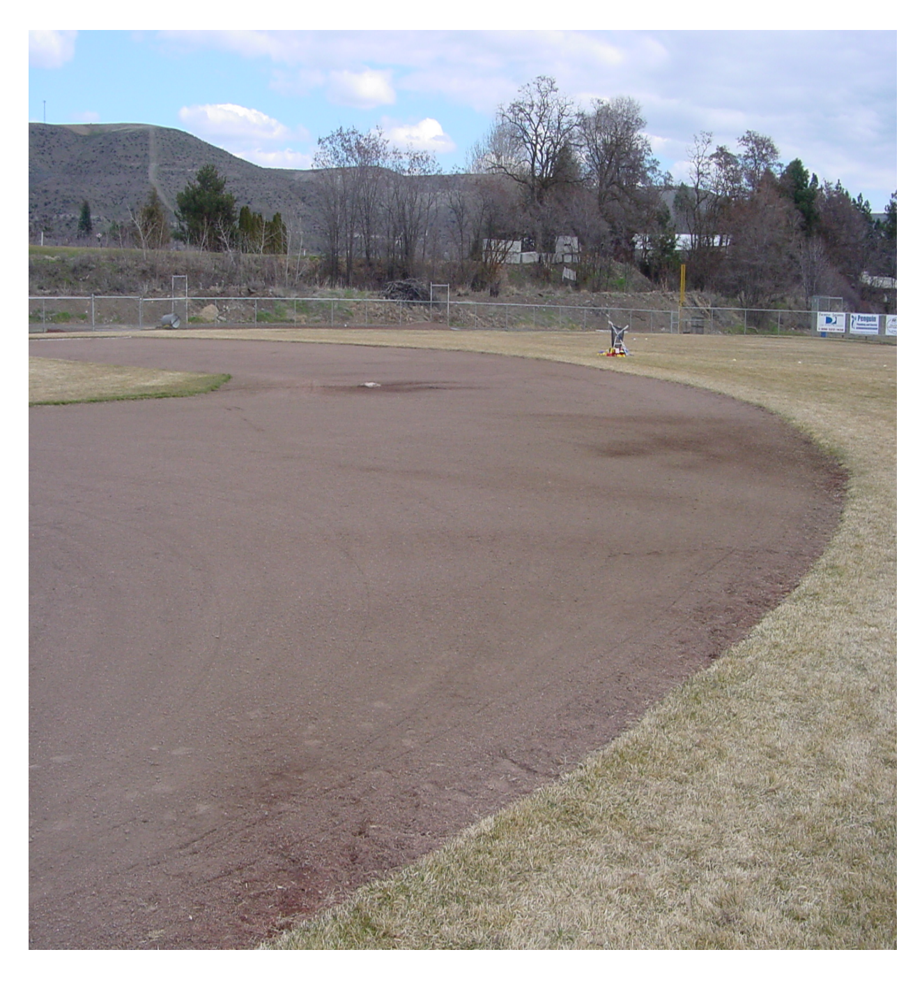
Figure 2. Exposed soil along baseball field, Naches Valley Intermediate School, Naches, Washington.