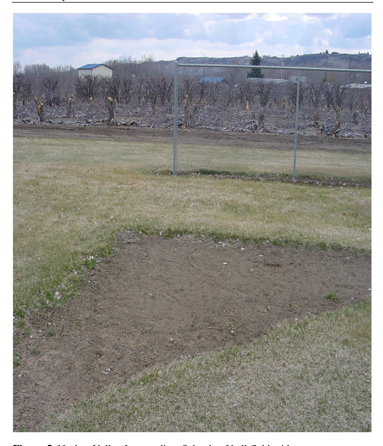
Figure 5. Naches Valley Intermediate School softball field with open access to an orchard land, Naches, Washington.