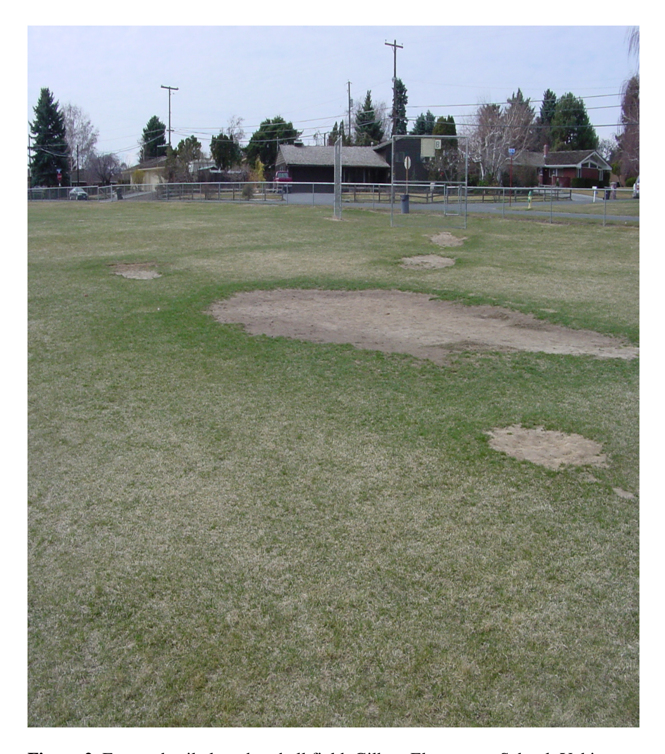
Figure 2. Exposed soil along baseball field, Gilbert Elementary School, Yakima, Washington.