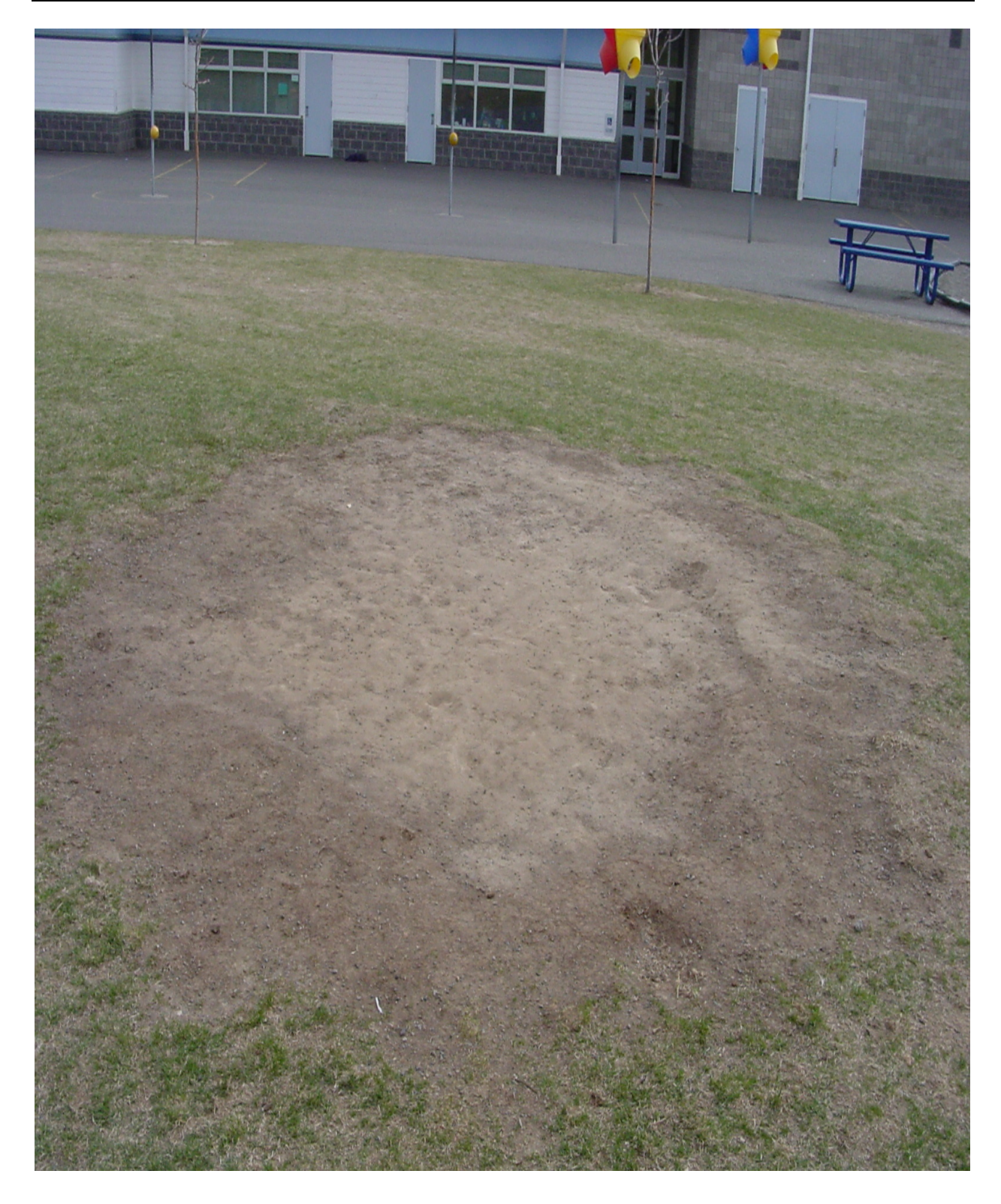
Figure 3. Playground field at Gilbert Elementary School, Yakima, Washington.