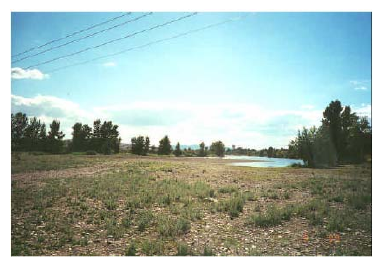
Figure 3. Common Use Area River Road 95 at Star Road Spokane River, Spokane, Washington.