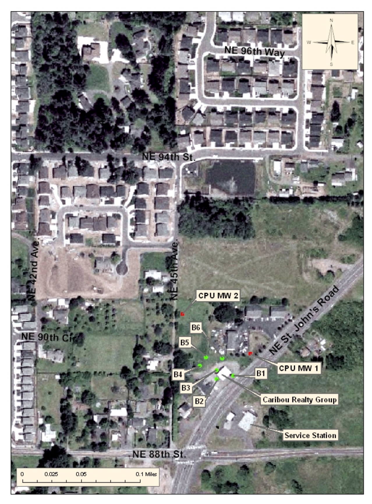
Figure 2: Site Map Caribou Realty Group Site Vancouver, Washington