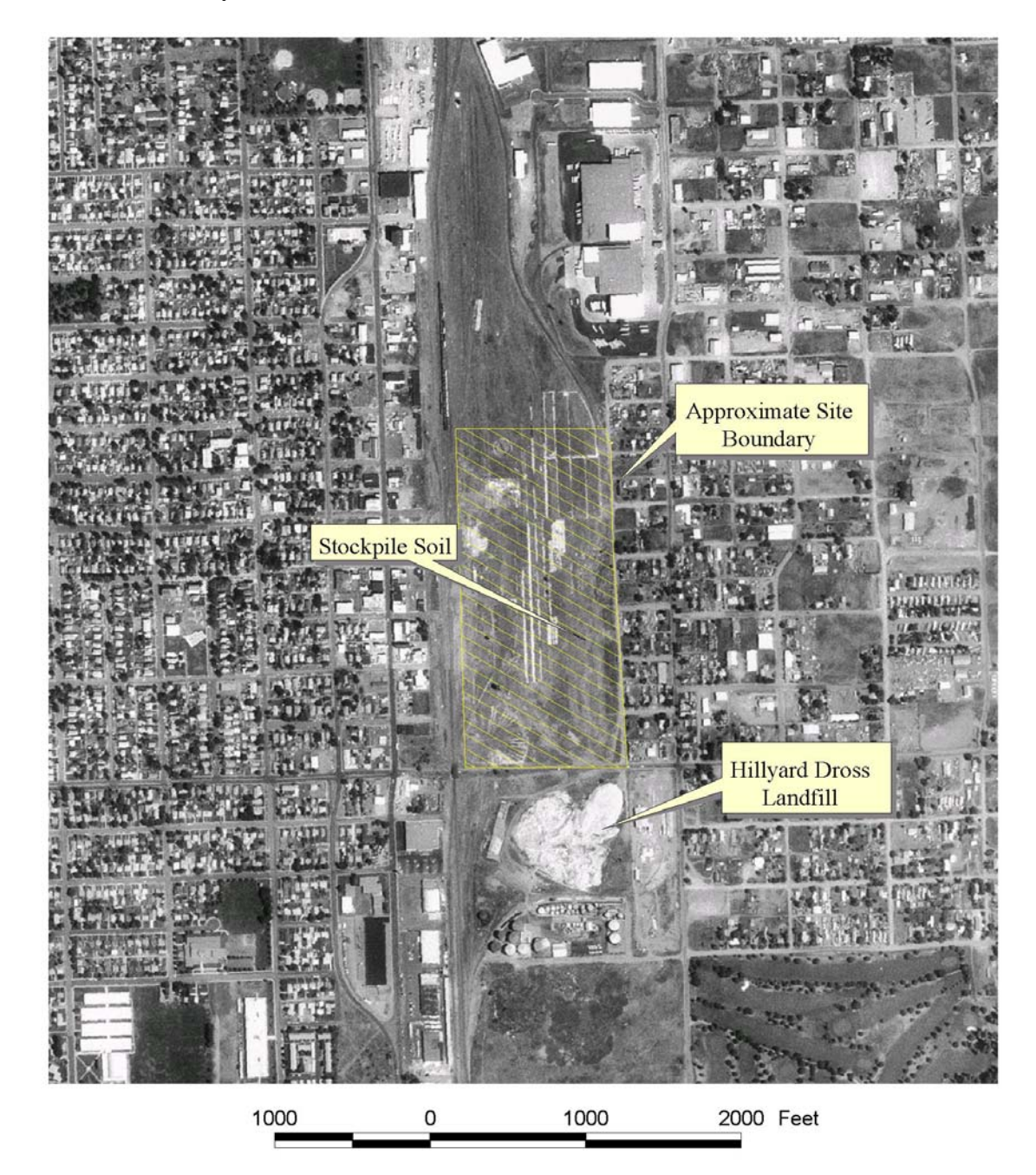
Figure 2: Arial photograph of Hillyard area, Spokane, Washington, showing the lead contaminated site, July 16, 1995.