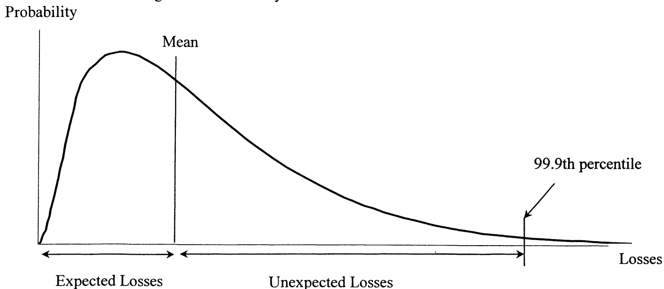
Figure 1 – Probability Distribution of Potential Losses

The area under the curve to the right of a particular loss amount is the probability of experiencing losses exceeding this amount within a given time horizon. The figure also shows the statistical mean of the loss distribution, which is equivalent to the amount of loss that is “expected” over the time horizon. The concept of “expected loss” (EL) is distinguished from that of “unexpected loss” (UL), which represents potential losses over and above the expected loss amount. A given level of unexpected loss can be defined by reference to a particular percentile threshold of the probability distribution. In the figure, for example, the 99.9th percentile is shown. Unexpected losses, measured at the 99.9th percentile level, are equal to the value of the loss distribution corresponding to the 99.9th percentile, less the amount of expected losses. This is shown graphically at the bottom of the figure.