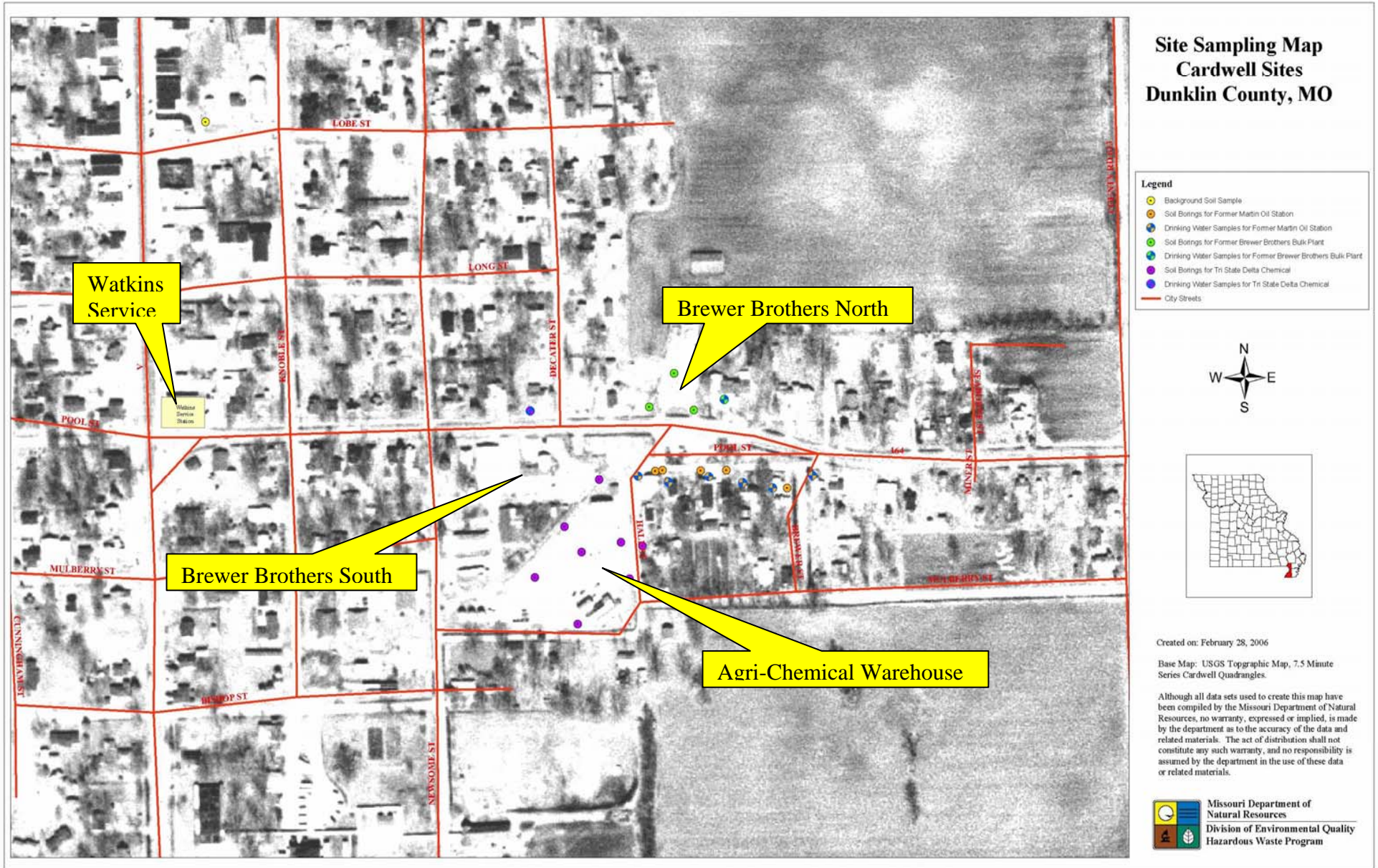
Figure 1. Map of Cardwell, Missouri