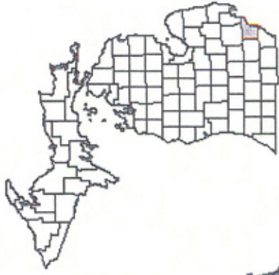
Wayne County, MI

From Lansing take I-96 East to I-275. Take I-275 South to I-94 East (exit 17). Follow I-94 East to exit 203 Southfield Road. Take Southfield Road east (right) to 9th Street. Turn right on 9th Street. Take 9th Street to Mill Street. Turn left on Mill Street. The property is located on the right hand side of the street.