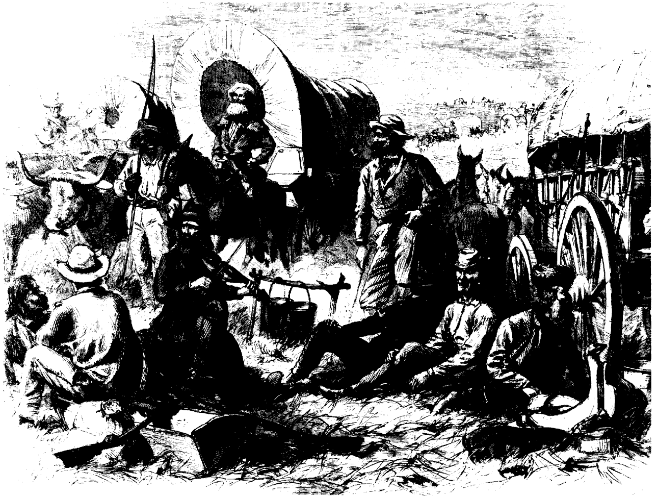
PILGRIMS OF THE PLAINS.

Large numbers of emigrants (in 1850, 50,000 traveled through South Pass) and animals passing over the same trails and camping at the same locations without sanitary precautions contaminated the water supply and the soil and made disease inevitable.