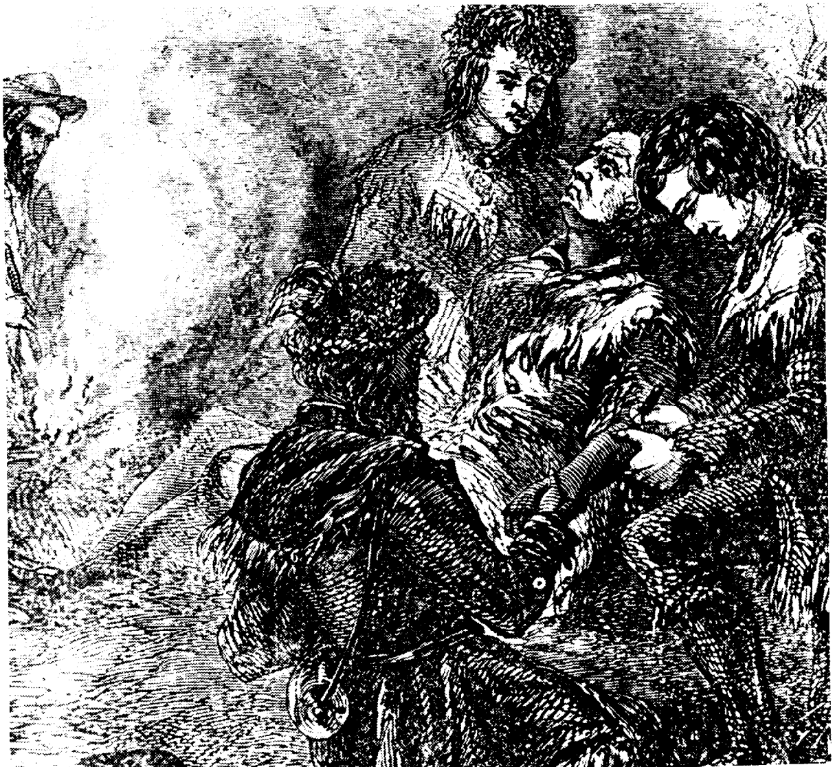
On many occasions the "Green River" hunting knife was the only surgical instrument available to the fur trapper.