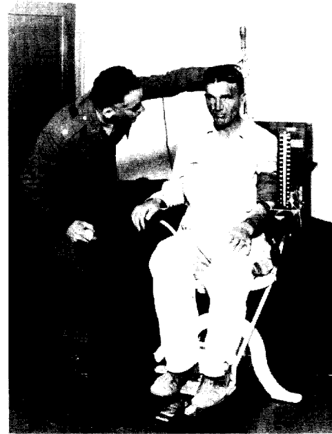
The Barany Chair