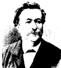
Paul Bert (1833–1886)

investigation of the nature and properties of the atmosphere which surrounds us" is given to John Jeffries, of Boston. Jeffries' ascent, in 1784, was followed by his flight with Jean