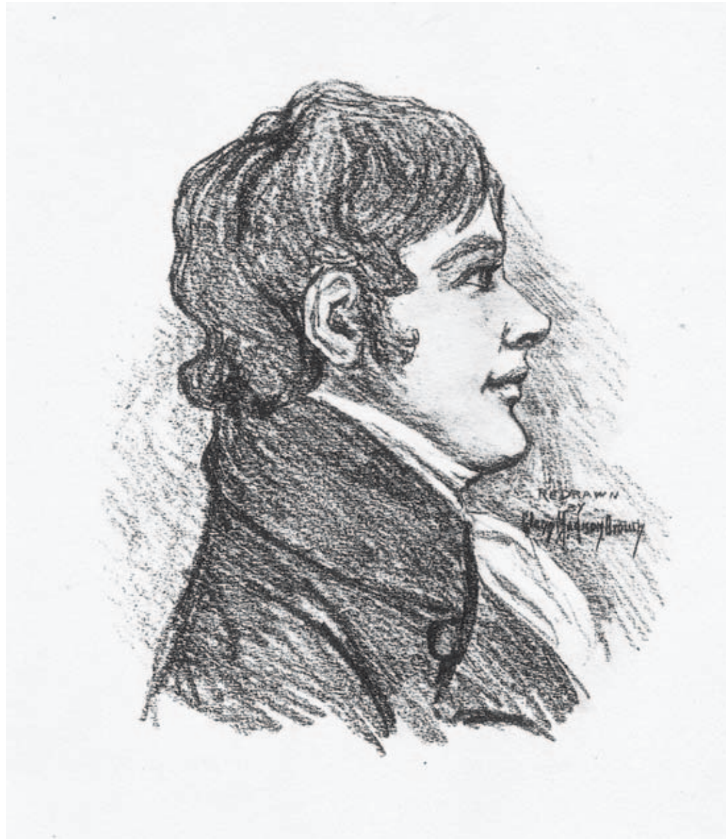
ROBERT MILLS ARCHITECT.