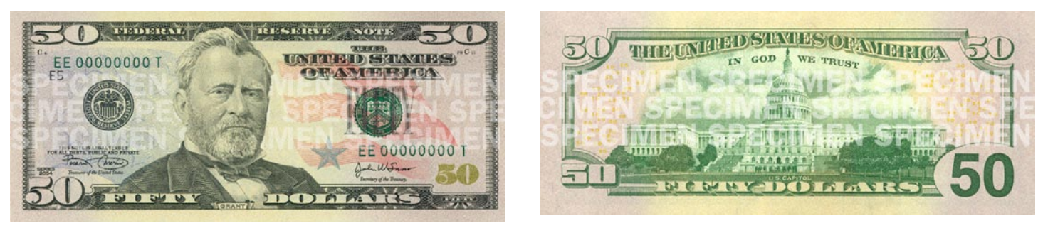
Issued: 2004. Colors: Blue, red. Symbol of freedom: the American flag.