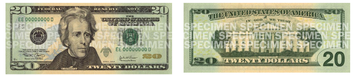
Issued: 2003. Colors: Green, peach, blue. Symbol of freedom: an American eagle.

Issued: 2006. Colors: Orange, yellow, red. Symbol of freedom: the Statue of Liberty's torch.