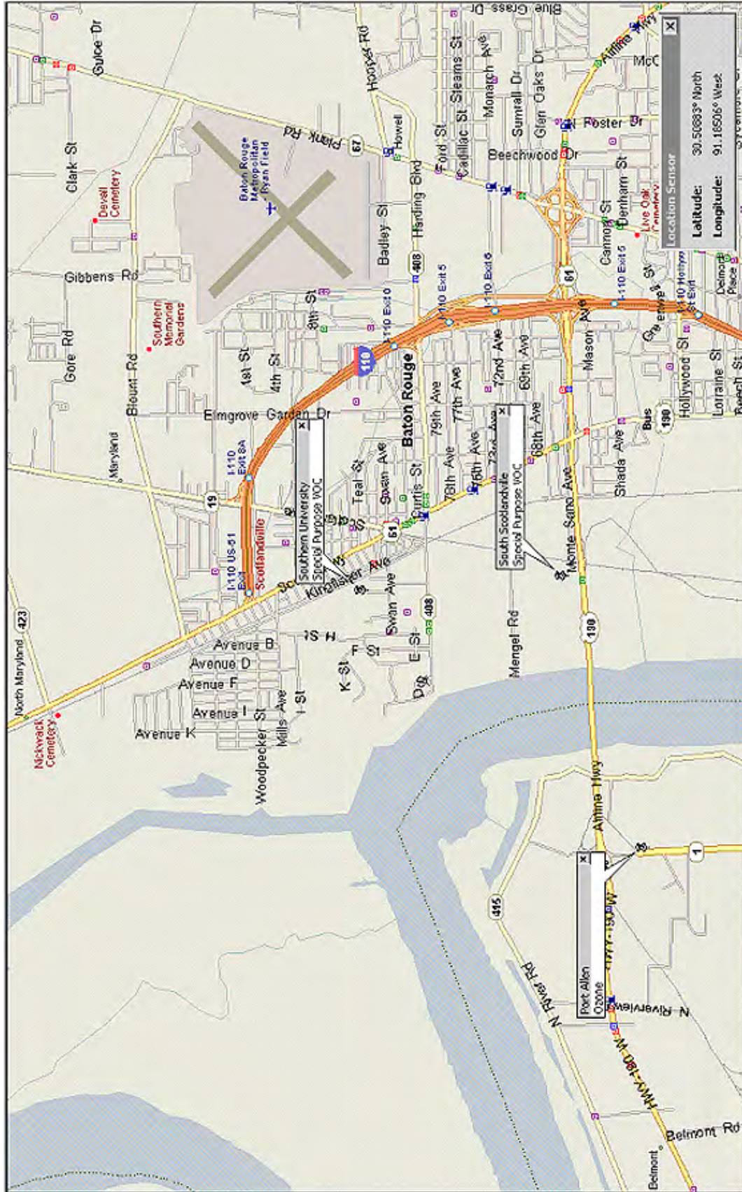
Figure 2: Detailed Map of South Scotlandville Air Monitoring Station Location

Map Adapted from information provided by the Louisiana Department of Environmental Quality