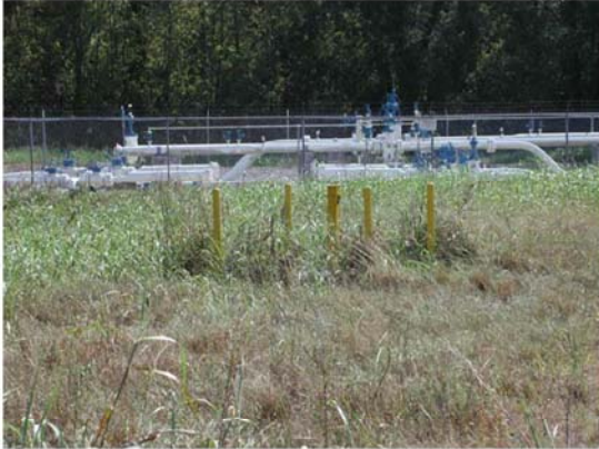
File Name: P1010053.JPG Date/Time Taken: 12 Oct 2005 1500 Description: Southeast corner of the site. Photo is looking south.