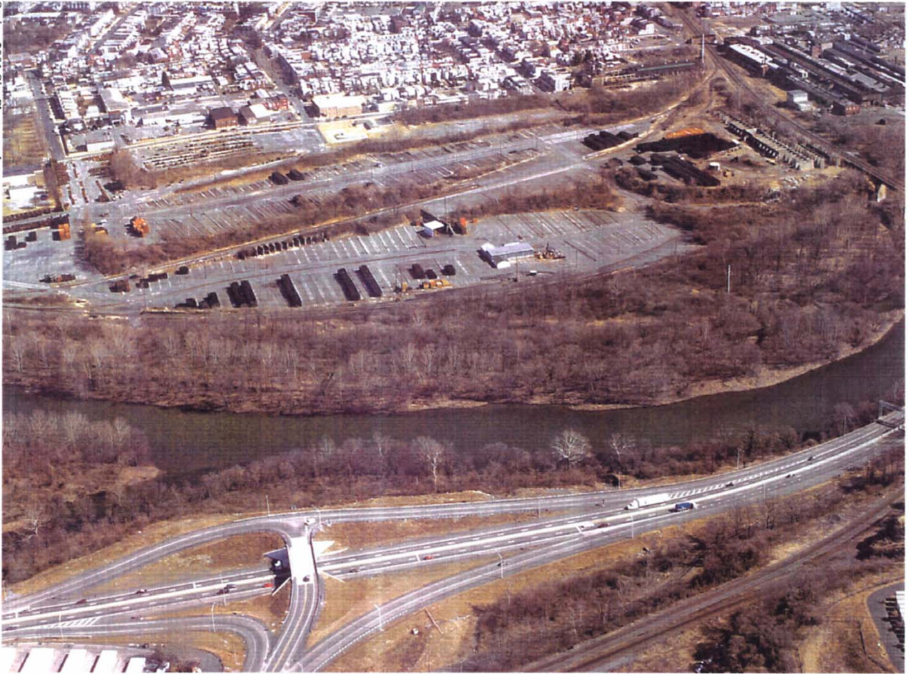
Figure 3: Site Aerial Photo