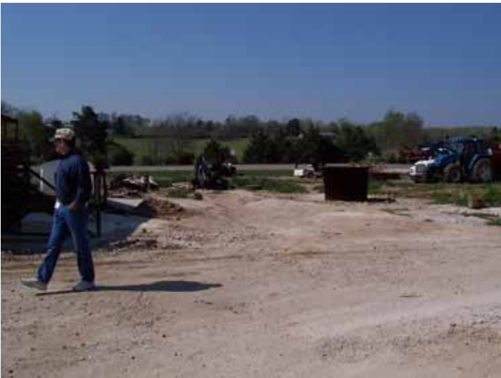
Another view of the alleged pit area, looking towards Highway 374.