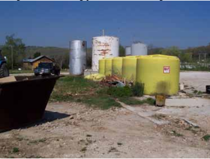
Tanks storing feed adjacent to store.