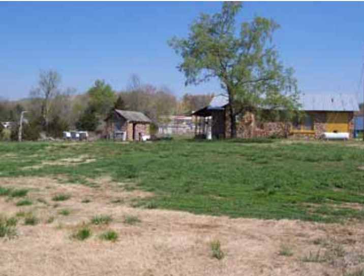
Side view of vacant house and adjacent small building. Photo taken from paved drive and culvert, where Highway 374 and site property join.