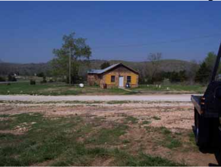
Vacant residence and capped PVC pipes located on the site.