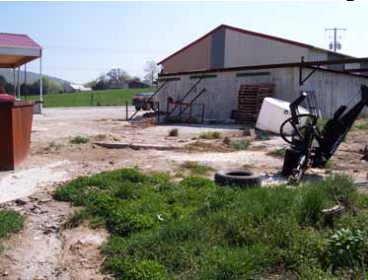
Alleged wood treating pit area and building where chemical fertilizer is stored – in stalls.