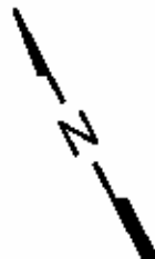
St. Joe Site Map 11/14/2002 Figure 1