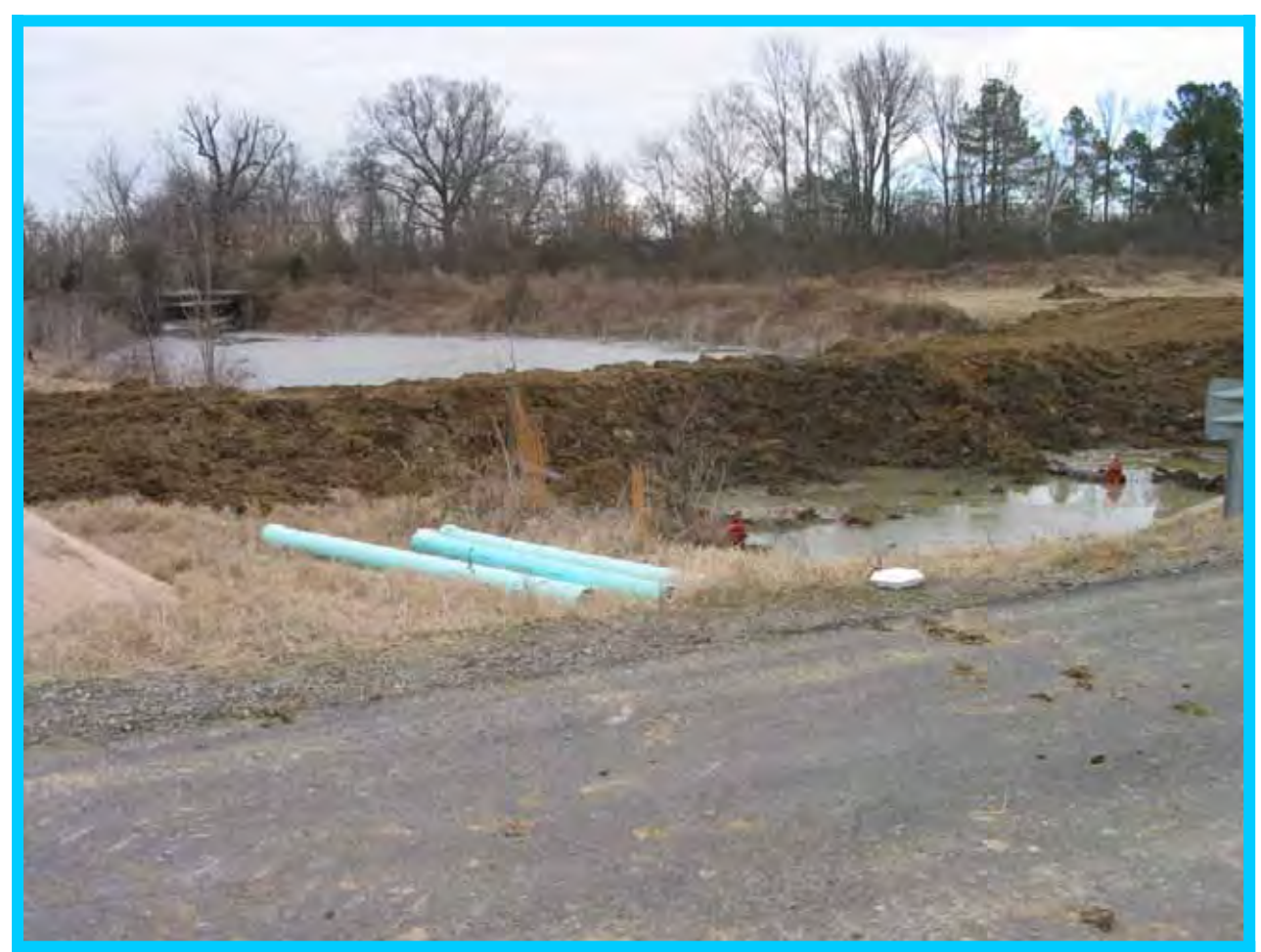
Figure 3. Photo of earthen dam on Railroad Creek to contain water used by fire department to fight the fire at Detco Industries.