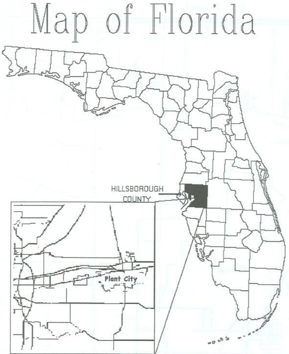
Figure 2: Plant City in Hillsborough County, FL