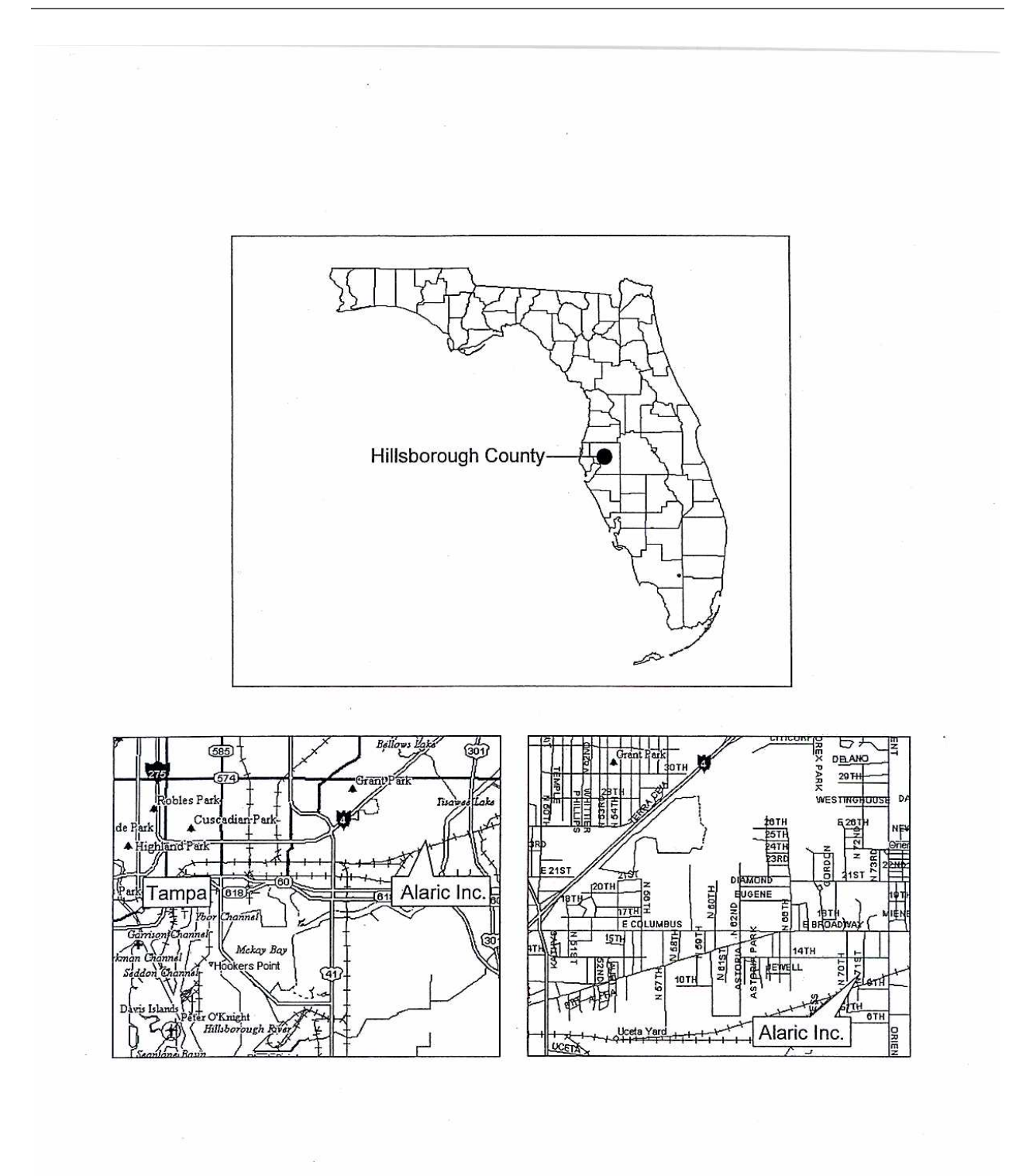
FIGURE 1. SITE LOCATION IN FLORIDA