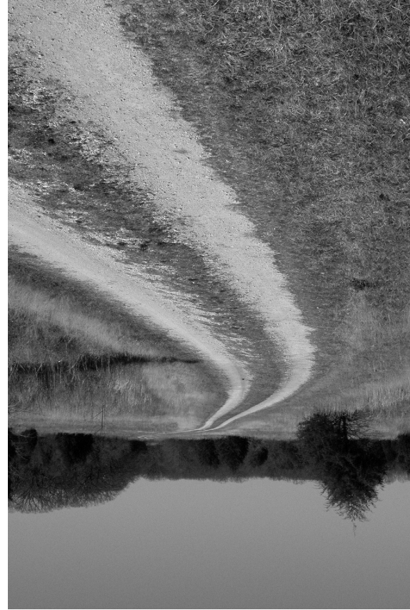
Lyndon B. Johnson National Grassland