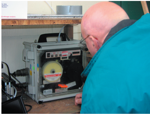
State employee setting up a continuous real-time air monitor at a residential location as part of the diisocyanate study.