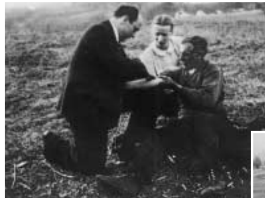
Dr. Robert Ritter and his associate Eva Justin taking a blood sample as part of their racial research on Gypsies. Landau, Germany, 1938.

Efforts to bring charges against Ritter and his associates as accessories in the deaths of the German Gypsies were discontinued. The trial of Dr. Robert Ritter ended with his suicide in 1950.