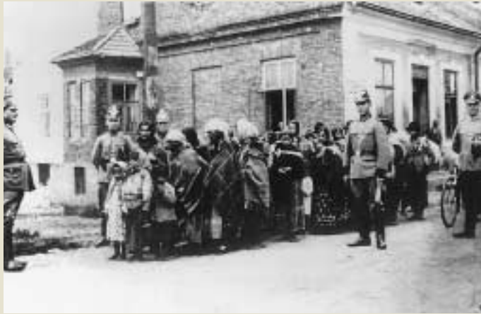
Prussian police escort Gypsies who are being deported to Auschwitz-Birkenau. Germany, 1943-1944.

of the state. Gypsy school-children who were truant were deemed delinquent and sent to special juvenile schools; those unable to speak German were deemed feeble-minded and sent to “special schools” for the mentally handicapped. Like Jewish children, Gypsy boys and girls also commonly endured the taunts and insults of their classmates, until March 1941 when the regime excluded Gypsies from the public schools.