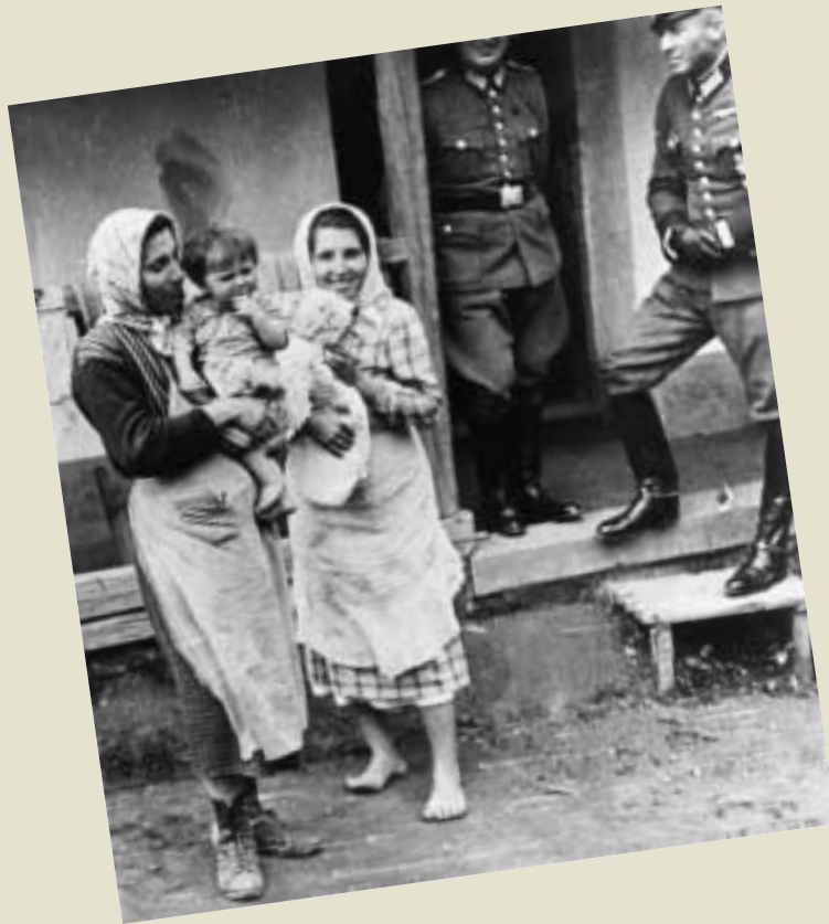
Gypsies arrested by German military police in the occupied Soviet Union and photographed for propaganda purposes. Most Gypsies rounded up by Germans after the invasion of the Soviet Union were killed in mass shootings. U.S.S.R., 1942.