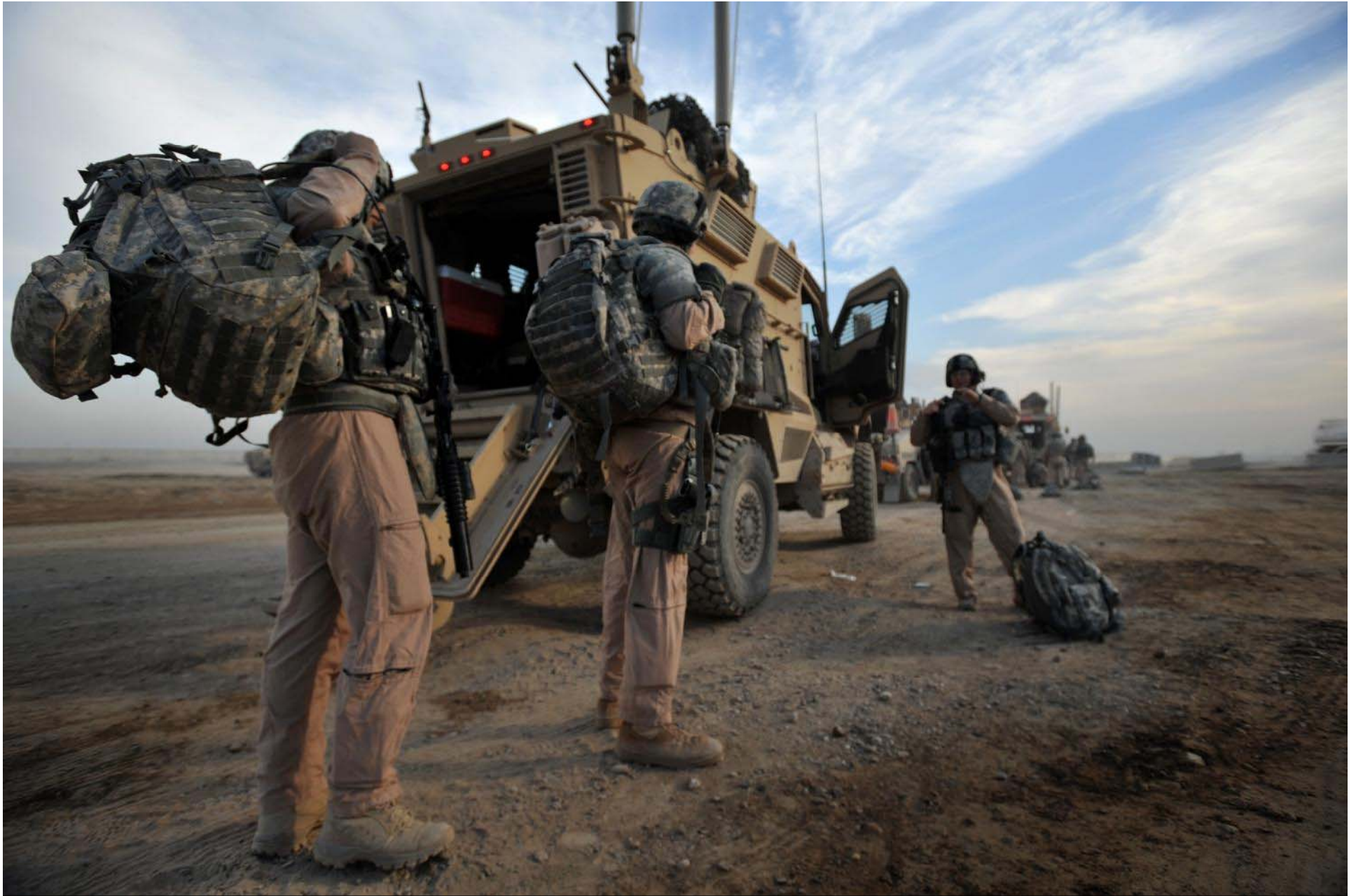
U.S. Airman assigned to 11th Security Forces Squadron, Detachment 3, 732nd Expeditionary Security Forces Squadron, 1st Brigade Combat Team, 4th Infantry Division, do last minute gear checks prior to leaving Forward Operating Base Falcon, located in southern Baghdad, Iraq, on Nov. 19, 2008 .

081119-N-1810F-001