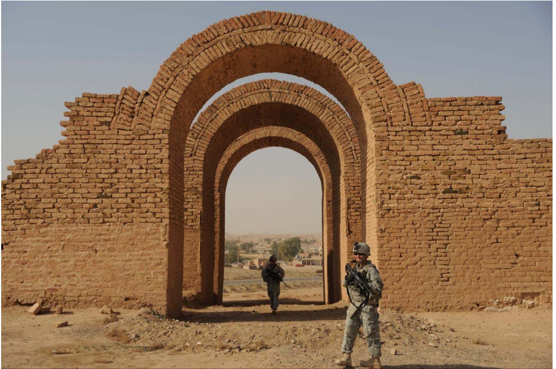
U.S. Soldiers from Crazy Horse Troop, 1st Squadron, 3rd Armored Cavalry Regiment, provide security for the Provincial Reconstruction Team (PRT) and representatives of United Nations Educational, Scientific, and Cultural Organization (UNESCO) visiting the ancient city of Ashur, the site is now known as Qalat Shergat, Iraq, on Nov. 21, 2008. Ashur is one of three areas in Iraq that is a World Heritage site.