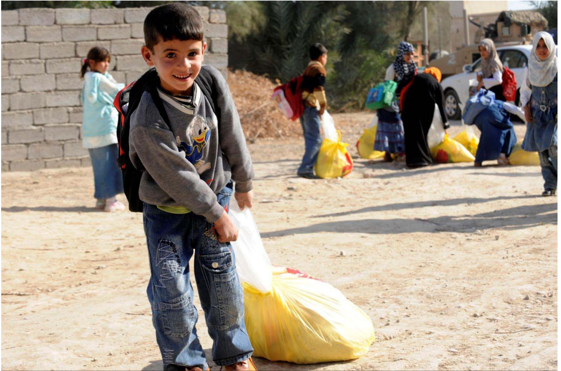
A young Iraqi boy drags his food packet home to his family in Al Makarim, Iraq, on Nov. 19, 2008. The El Salvadoran Army along with Iraqi and U.S. Soldiers, teamed up to provide humanitarian aid to the village. ]