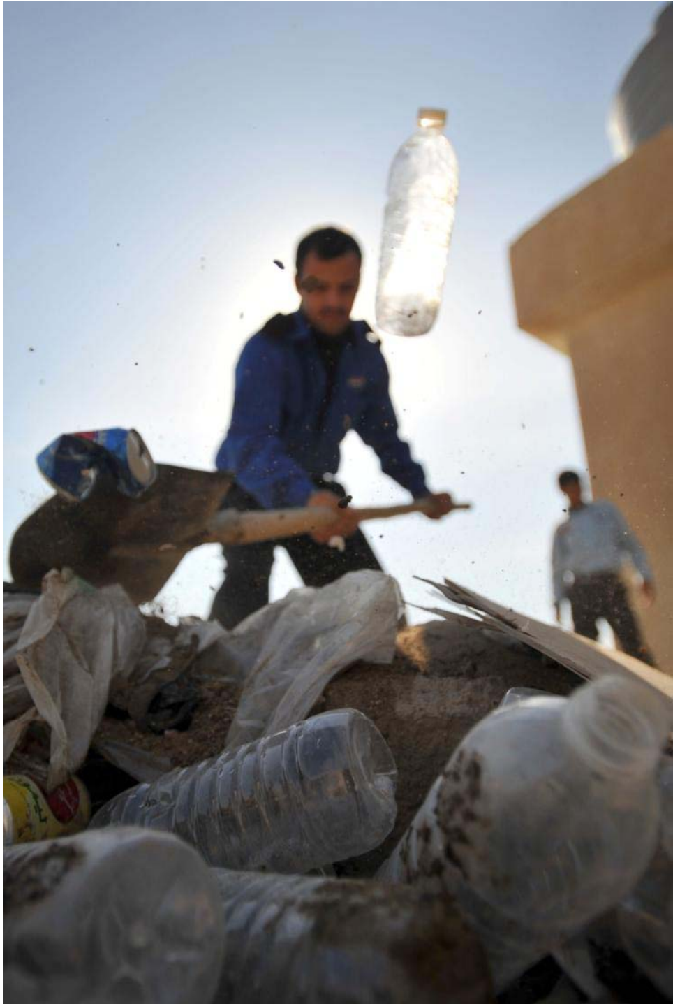
An Iraqi policeman shovels trash outside Al Radwanyia Police Station, located in southern Baghdad, Iraq, on Nov. 19, 2008.

081119-N-1810F-088