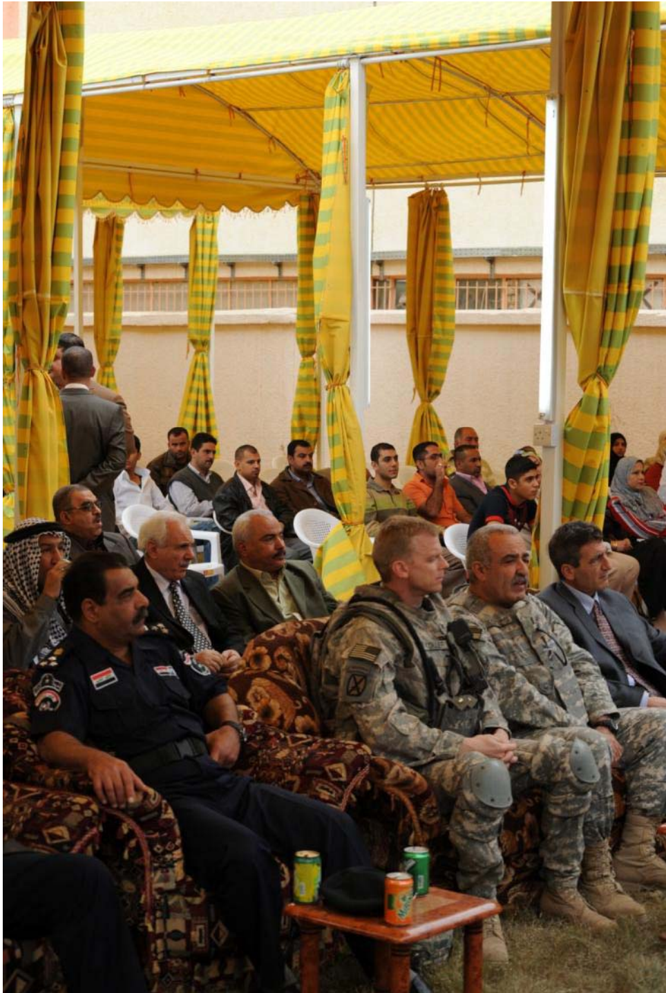
Dignitaries and guests listen to a speech given during a grand opening ceremony for the district advisory council hall for the Rusafa political district in Muhallah 505, Idrissi, eastern Baghdad, Iraq, on Nov. 20, 2008.

081120-A-4676S-099