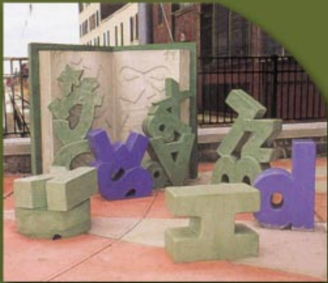
West Side Avenue, Bayonne Bumper Structure, Don Kennell