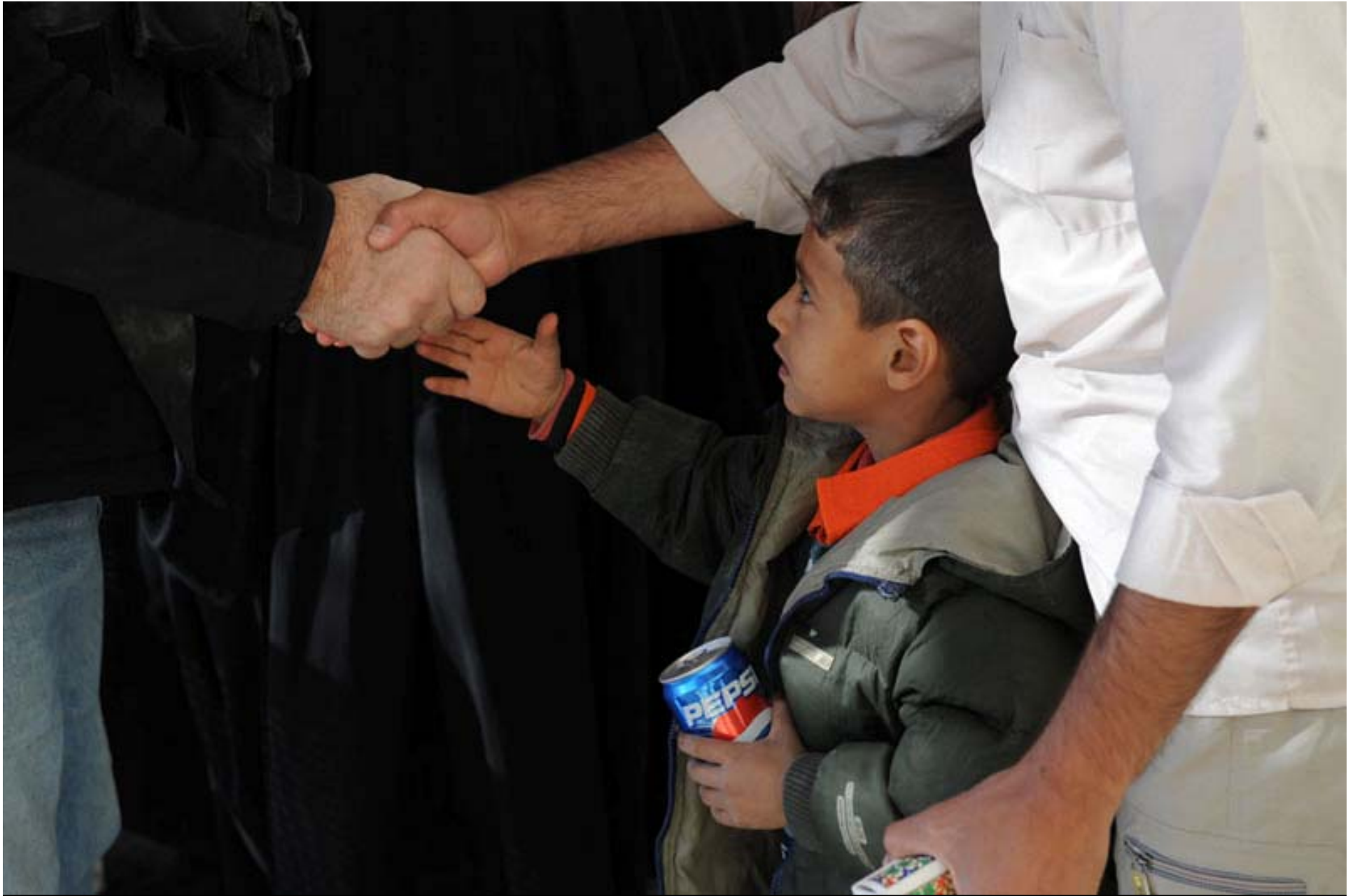
The son of a recently released detainee shakes hands in the village of Tamine, Iraq, Dec. 12, 2008. Two men who were detained and later found innocent are released at a special ceremony.

(U.S. Army photo by Spc. Chase Kincaid/Released) 081212-A-8201K-056