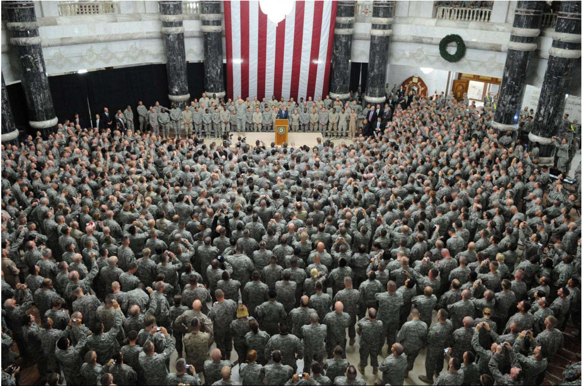
U.S. President George W. Bush meets with U.S. military personnel during a surprise visit to Al Faw Palace, Camp Victory, Iraq, Dec. 14, 2008.

081214-A-0402P-029