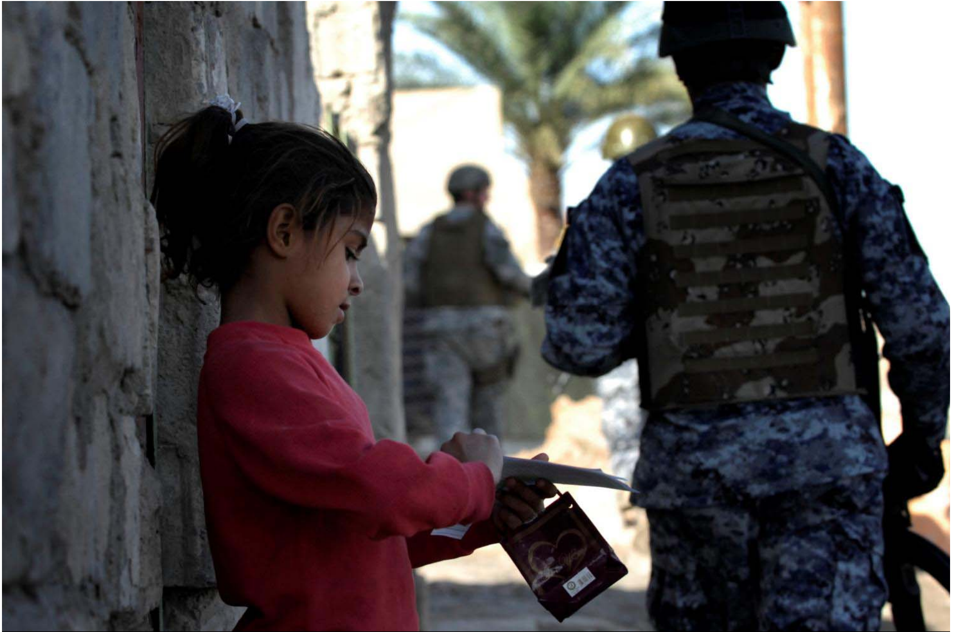
An Iraqi child looks over a leaflet given to her by Iraqi national policemen during a walking patrol in the Rashid community of southern Baghdad, Iraq, Dec. 06, 2008.

081204-N-1810F-047