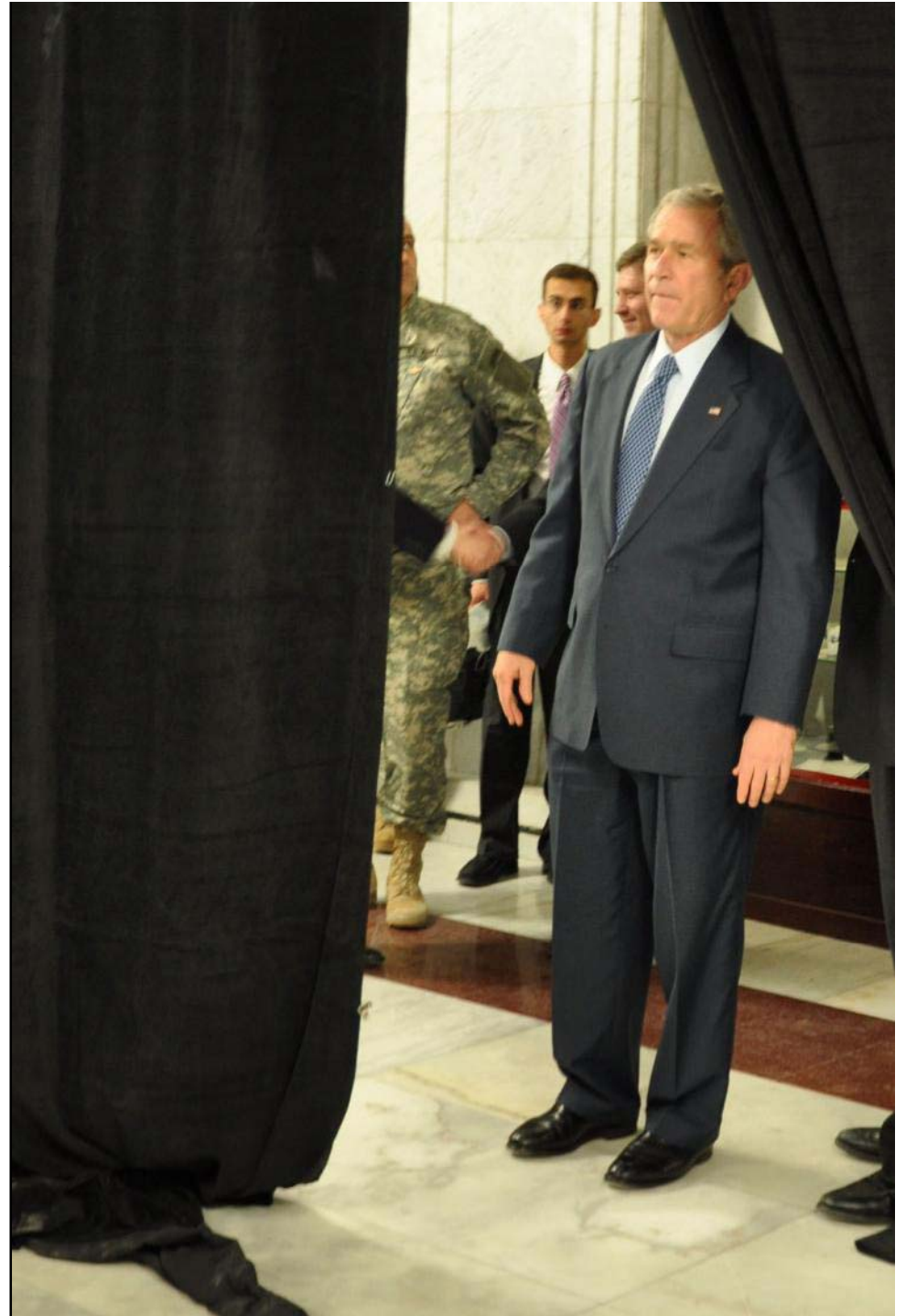
U.S. President George W. Bush prepares to meet with U.S. military personnel at the Al Faw Palace at Camp Victory, Baghdad. The President made a surprise visit to Baghdad, Iraq, Dec. 14, 2008.

081214-N-6688F-015