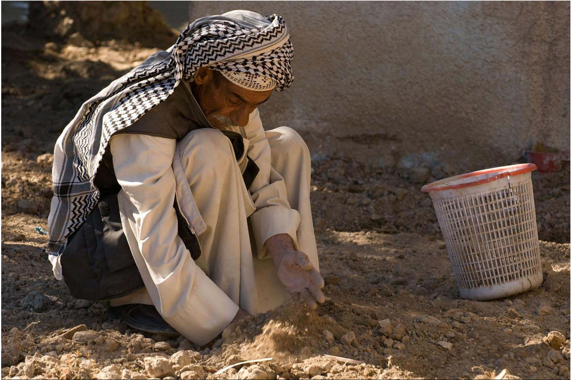
An Iraqi man works in the garden of the Al Hayyaniah district Police Station in Basra, Iraq, Dec. 13, 2008.

081213-A-68510-106