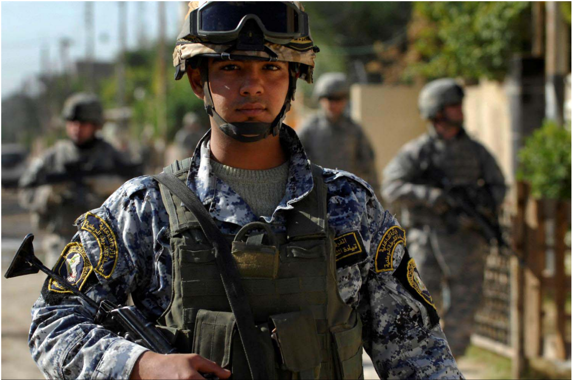
An Iraqi national policemen patrols forward of U.S. Army Soldiers during a joint patrol, meeting Iraqi civilians and handing out leaflets in the Rashid community of southern Baghdad, Iraq, Dec. 06, 2008 . The Soldiers are assigned to 1st Battalion, 22nd Infantry Regiment, 1st Brigade Combat Team, 4th Infantry Division.

081206-N-1810F-043