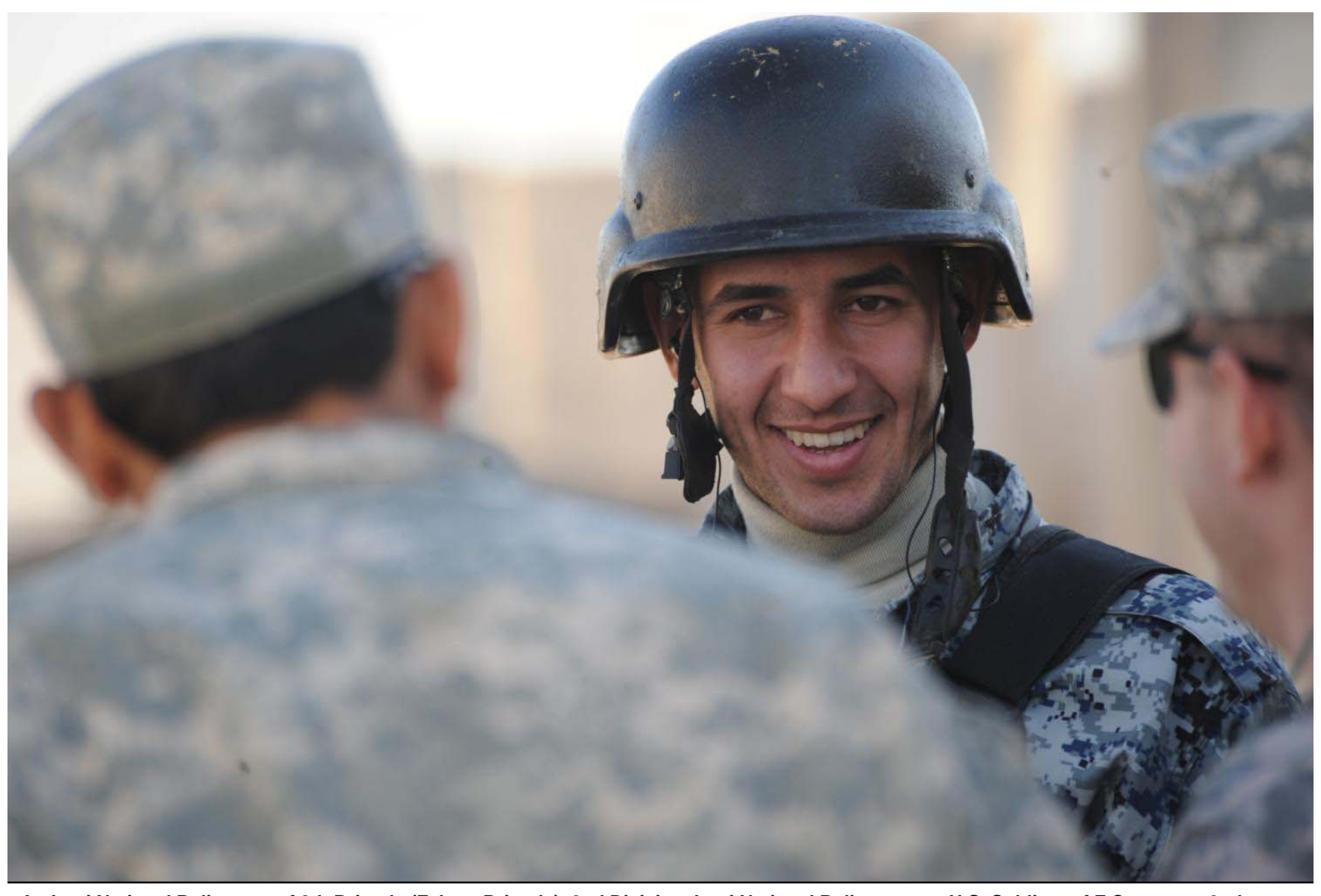
An Iraqi National Policeman of 8th Brigade (Falcon Brigade), 2nd Division, Iraqi National Police, greets U.S. Soldiers of F Company, 2nd Battalion, 505th Parachute Infantry Regiment, 3rd Brigade Combat Team, 82nd Airborne Division, after returning from a convoy operation, at Joint Security Station Beladiyat, in Muhallah 732, Beladiyat, eastern Baghdad, Iraq, on Jan. 5th, 2009. 090105-A-4676S-583