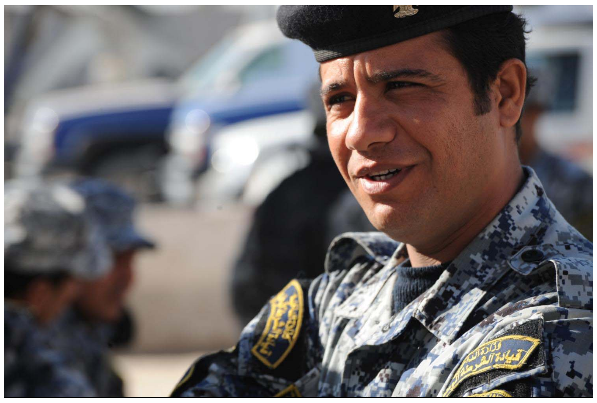
An Iraqi National Policeman talks to his colleagues while waiting to receiving Humvee familiarization training from U.S. Soldiers of F Company, 2nd Battalion, 505th Parachute Infantry Regiment, at Joint Security Station Beladiyat, in Muhallah 732, Beladiyat, eastern Baghdad, Iraq, on Jan. 5th, 2009.

090105-A-4676S-131