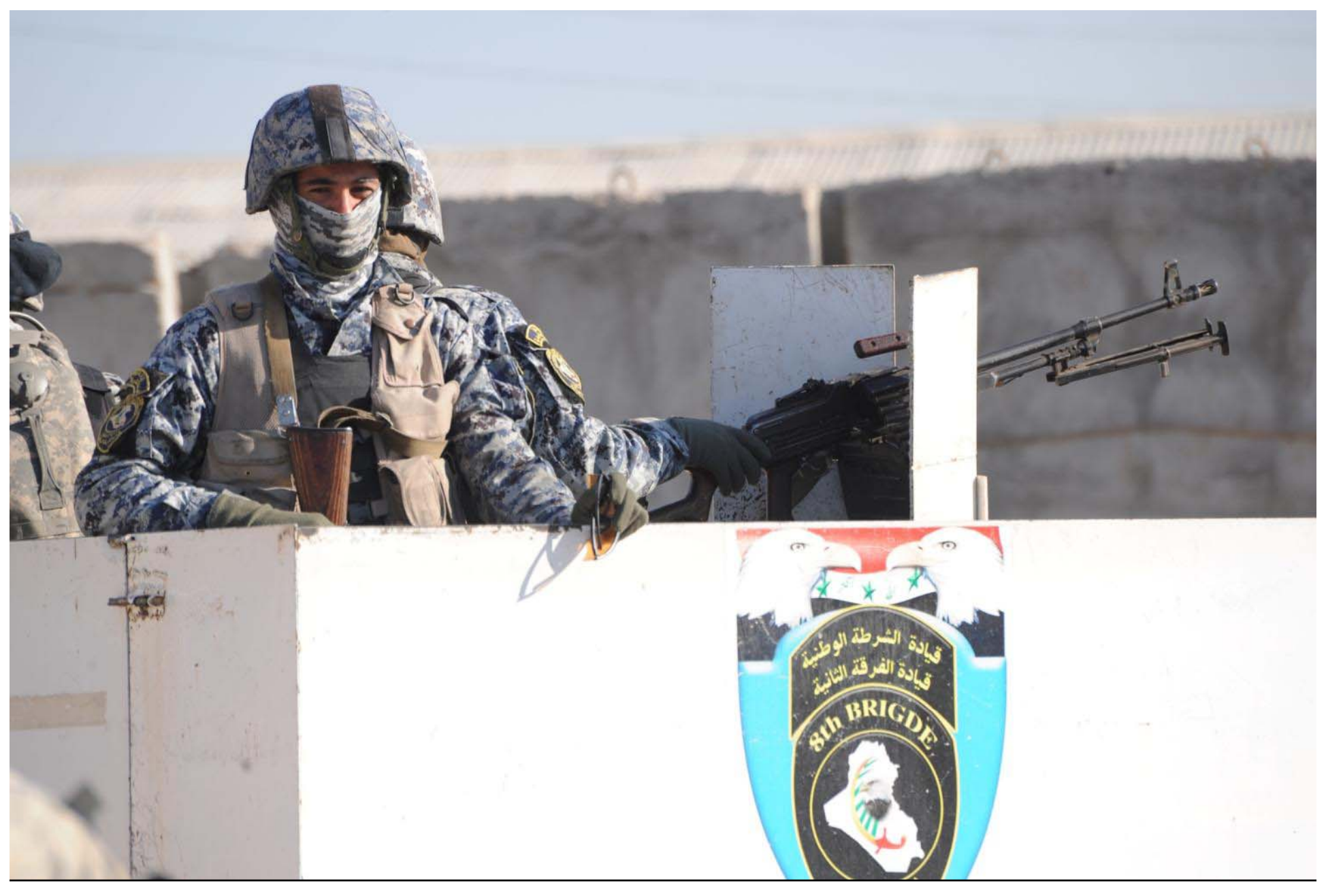
An Iraqi National Policeman of 8th Brigade (Falcon Brigade), 2nd Division, Iraqi National Police, looks out from the back of a vehicle returning from a convoy operation, at Joint Security Station Beladiyat, in Muhallah 732, Beladiyat, eastern Baghdad, Iraq, on Jan. 5th, 2009.