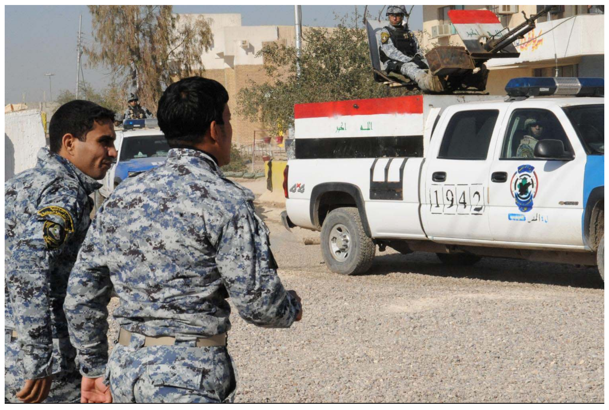
Iraqi National Policemen of 8th Brigade (Falcon Brigade), 2nd Division, Iraqi National Police, shout a greeting to their comrades departing for a quick reaction mission at Joint Security Station Beladiyat, in Muhallah 732, Beladiyat, eastern Baghdad, Iraq, on Jan. 5th, 2009.