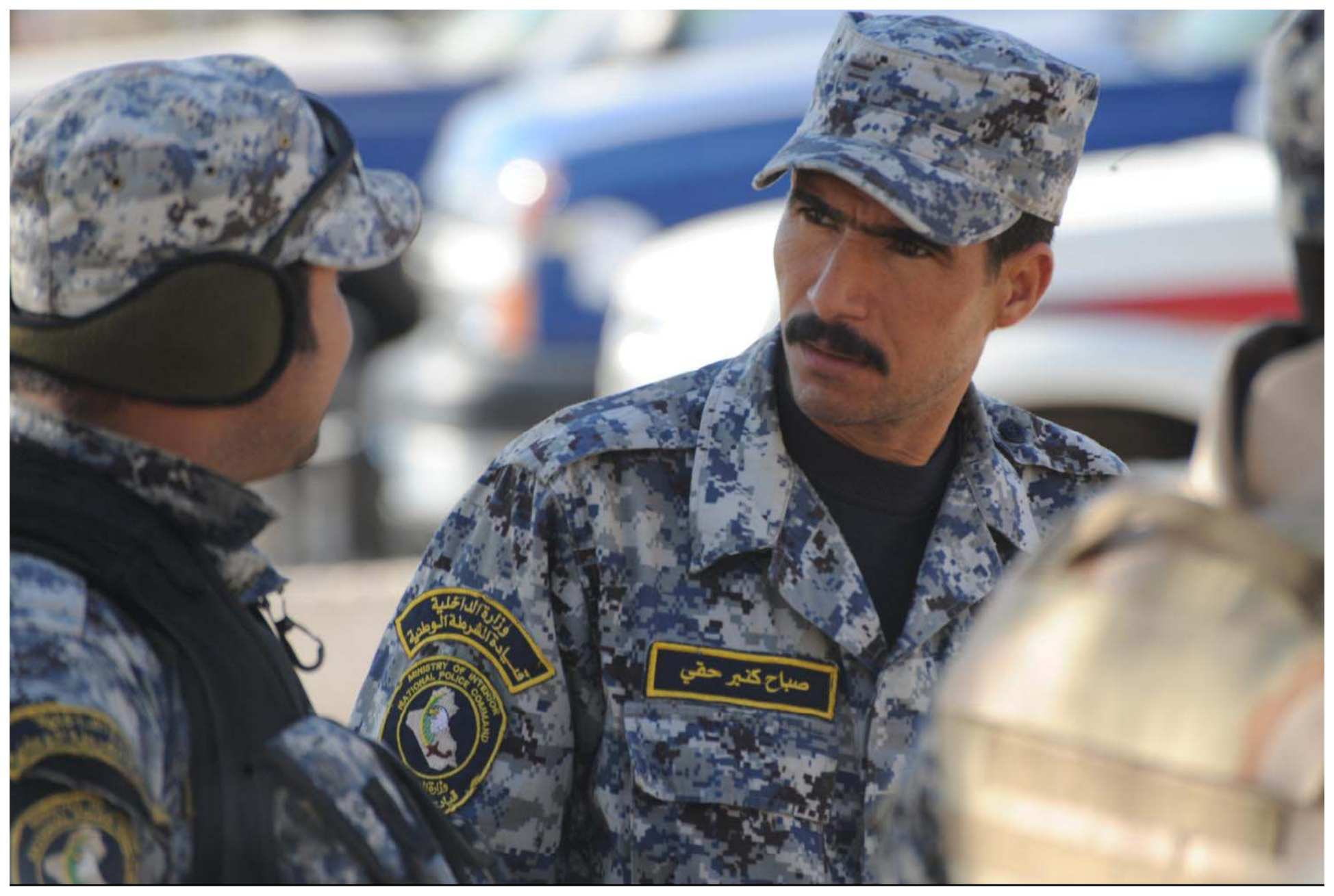
Iraqi National Policemen have a discussion prior to receiving Humvee familiarization training from U.S. Soldiers of F Company, 2nd Battalion, 505th Parachute Infantry Regiment, Joint Security Station Beladiyat, in Muhallah 732, Beladiyat, eastern Baghdad, Iraq, on Jan. 5th, 2009.