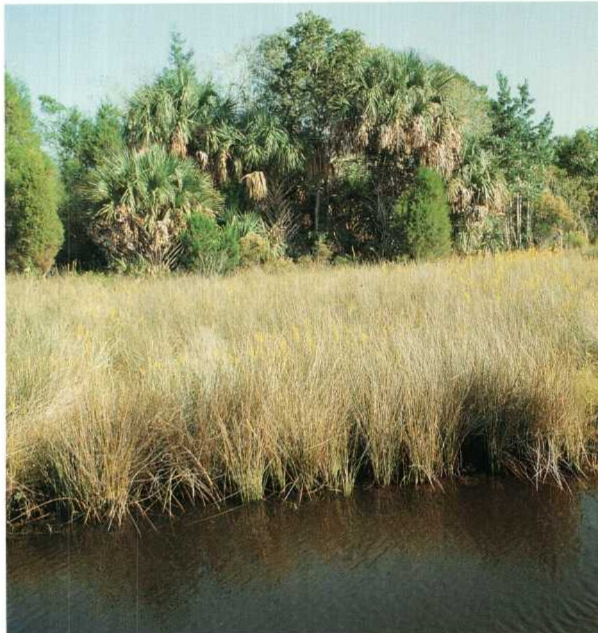
left: Smooth Cordgrass ESTUARINE INTERTIDAL EMERGENT

During the 1980's, land purchases by both the Federal and state governments have put thousands of fragile wetland acres in public ownership. The Fish and Wildlife Service added nearly 250,000 acres, most of which were wetlands, to the National Wildlife Refuge System in Florida. The National Park Service has been authorized to acquire 107,600 acres in the East Everglades and 146,000 acres in Big Cypress Swamp. The U.S. Forest Service is purchasing 60,000 to 90,000 acres of Pin Hook Swamp linking Osceola National Forest and Okefenokee Swamp.