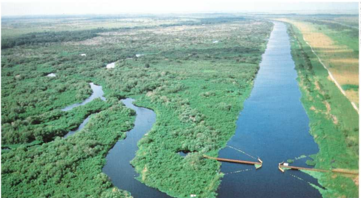
5 FLA WATER MGMT DIST

Growing recognition and concern over an array of environmental problems resulted in passage of significant legislation during the 1970's. Between 1969 and 1977, at least six Federal environmental statutes, including the National Environmental Policy Act, the Endangered Species Act, and the Clean Water Act, were passed. Florida passed a large additional body of state legislation that also improved wetland management. The environmental movement in Florida gained ground during this time period. Opposition mounted by environmental action groups helped to block the construction of the Cross-Florida Barge Canal and a regional jetport in the Big Cypress Swamp. Also in the 1970's, the state began to actively purchase valuable wetlands through programs such as the Environmentally Endangered Lands Program, the Conservation and Recreational Lands Act, and later the Save Our Rivers Program operated by the water management districts. In 1983, Governor Bob Graham announced a broad-based multi-million dollar program to restore the ecology of the Everglades. In 1984, Florida passed the Warren S. Henderson Wetlands Protection Act, which increased Department of Environmental Regulation jurisdiction over wetlands.