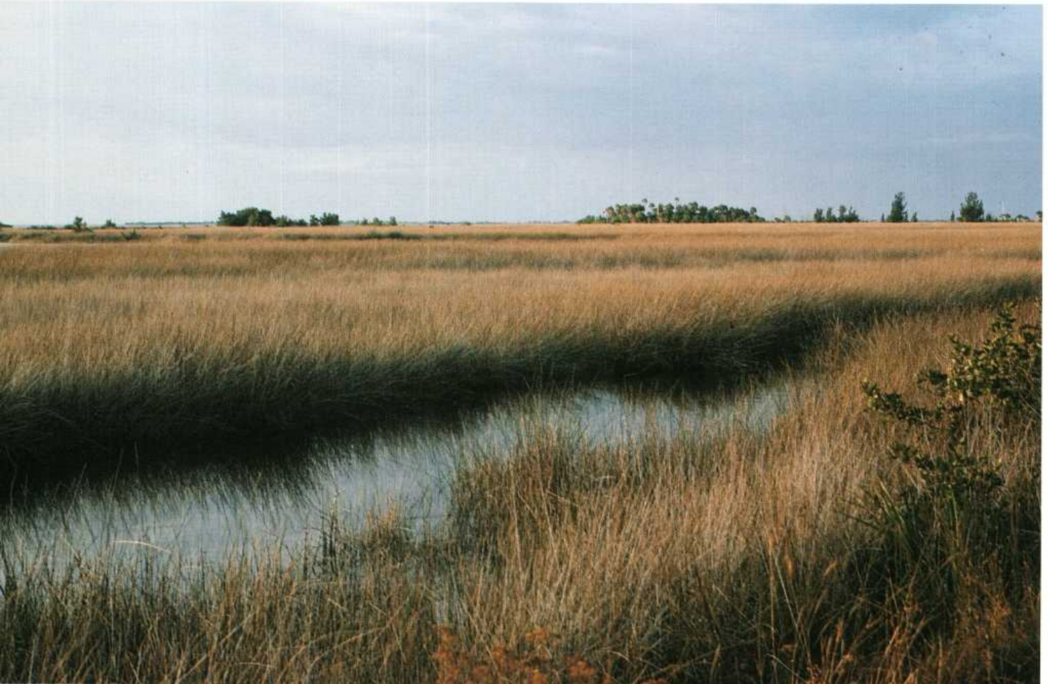
Black Needlerush Marsh, Hernando County ESTUARINE INTERTIDAL EMERGENT

Some loss in estuarine wetlands was experienced, with 2,800 acres consumed by urbanization. Of this total, 2,700 acres were previously estuarine vegetated wetlands.