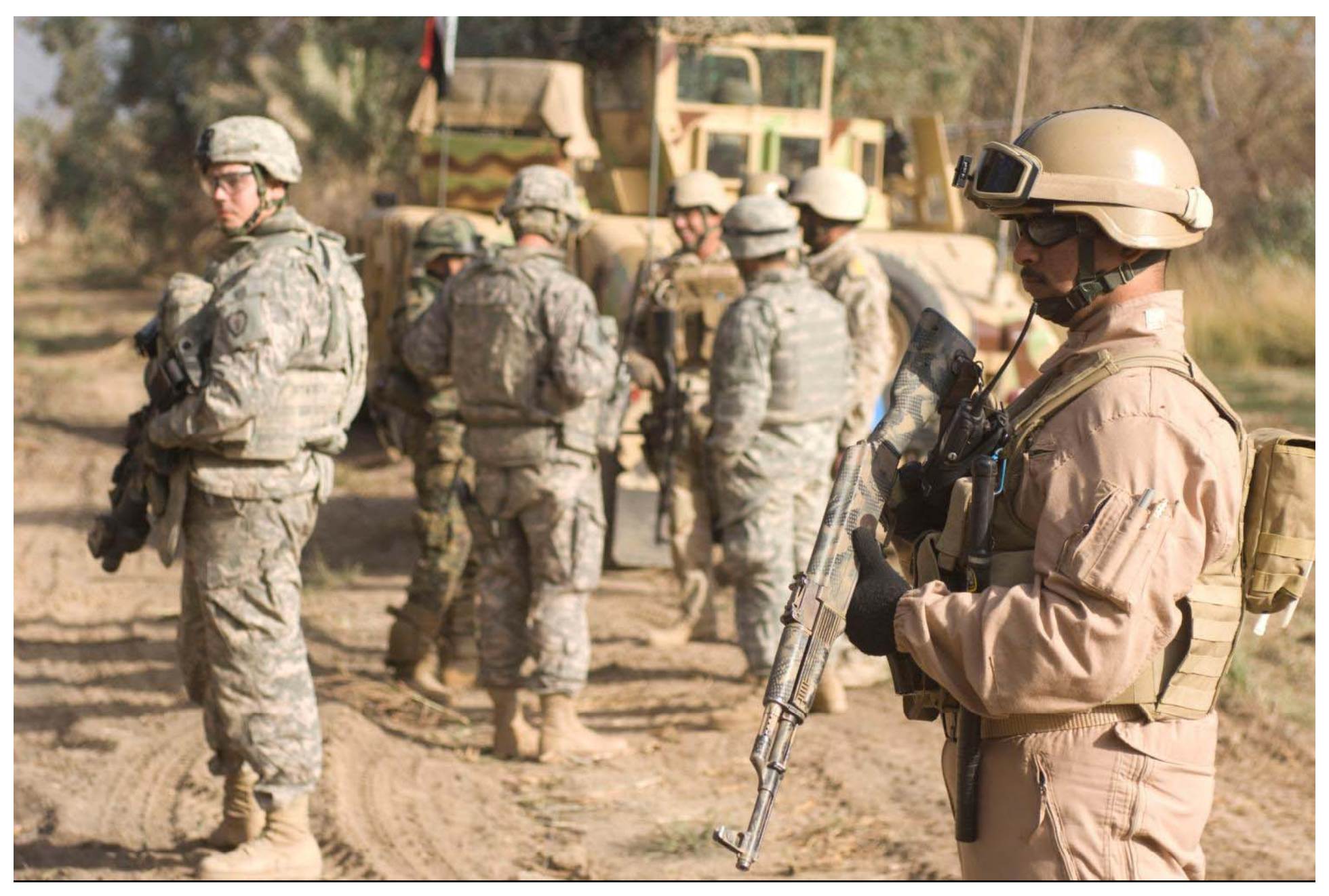
An Iraqi soldier provides perimeter security as U.S. and Iraqi Army leaders discuss the next step in an operation. Soldiers from the 1st Stryker Brigade Combat Team, 25th Infantry Division and Iraqi Soldiers from 5th Division are preparing palm groves around Naqib, Iraq that will expose the Improvised Explosive Devices and weapons caches that are hindering local Iraqi's attempts to farm this area Dec 20, 2008. 081220-N-1974P-023