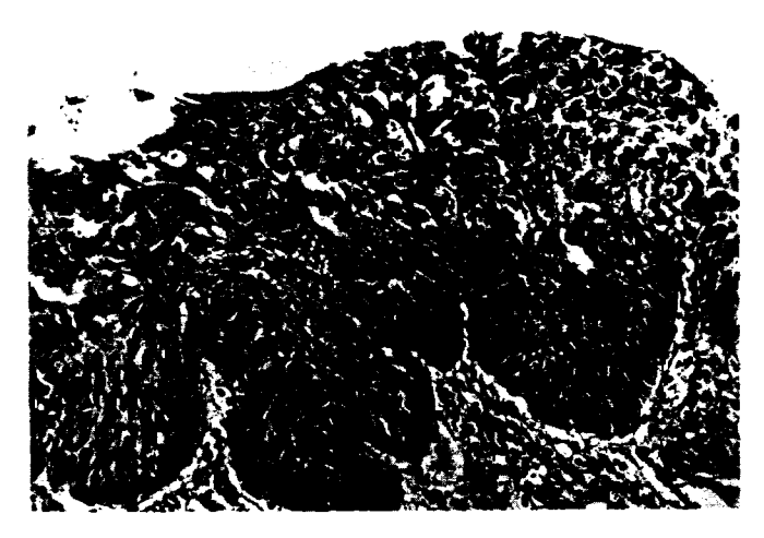
3. Extensive basal-cell hyperplasia with numerous atypical cells.

cigarettes smoked. Among non-smokers, lesions composed entirely of atypical cells with loss of cilia were uniformly absent, although a few could be seen with more than two rows of basal cells containing some atypical cells. In contrast, atypical cells were found in all lesions seen in the tracheobronchial tree of patients who smoked two or more packs of cigarettes a day, irrespective of the presence of hyperplasia and/or cilia loss or whether the patients died of lung cancer. The most severe lesion, aside from invasive carcinoma, consisted of loss of cilia, and hyperplasia up to five or more cell rows composed entirely of atypical cells. This lesion was never found among men who did not smoke regularly and was found only rarely among light smokers. However, it was found in 4.3 percent of sections from men