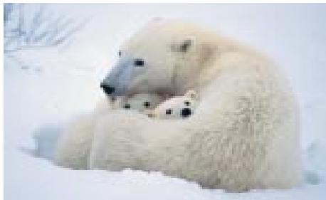
Above: Cooperative relationships with industry minimize impacts of energy development activities on polar bears.