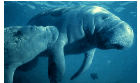
Above: Manatees are a favorite attraction for visitors to the Florida coast and intracoastal waterways.