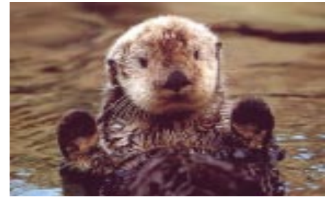
Above: Sea otters play an important role in the California coastal ecosystem.